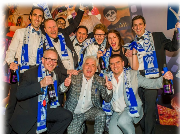
KidsOut's first-ever Question of Sport Bristol raised over £155,000

KidsOut's corporate networking events raised a total of over £400,000 during the 2019/20 financial year. None of this would have been possible without the hard work of the various event committees around the UK and the generosity of all those who attended the events.