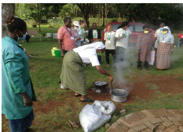
Photos of training in Subiaco

At a more local level non residential seminars have been organised by various churches and REAP staff have been able to facilitate with teaching on a range of topics. Two of the REAP staff conducted a five-day seminar in May 2021 for the students of the Africa Inland Church Missionary College in Eldoret. Although this training covers the range of the teaching we normally give, it has an extra focus on how Natural medicines can facilitate mission outreach.