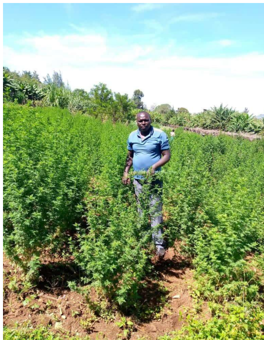
Artemisia on Isaac's farm

The REAP farm near Kisumu continues to thrive. Although the site has continued to develop as a Visitors' and Training Centre, visitors and groups have been fewer than previous years due to COVID19 restrictions. Most of the plants and techniques relating to the different aspects of REAP teaching can be seen. Since the reporting year has been dominated by COVID19 in Kenya and the resulting restrictions, the team based in Kisumu have not been able to get out and visit as they used to, so have focused on work within the farm and where possible they have been open to receive visitors and share with them.