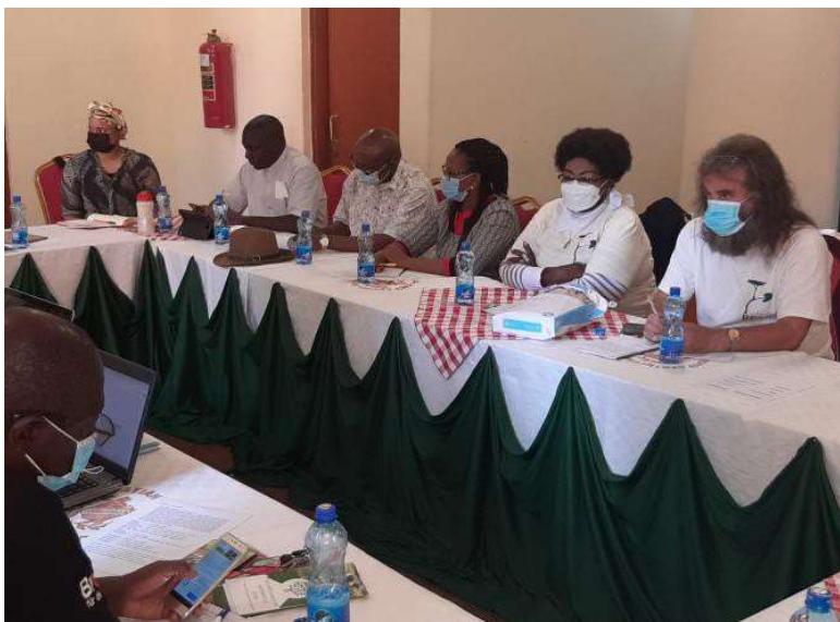
REAP representatives at Kenya Faith Based Tree Growing Round Table meeting

REAP has continued to network with other organisations with an emphasis on Creation Care. We give teaching relating to Creation Care and the Gospel whenever possible, encouraging churches to be responsible stewards in caring for the environment. We have responded to the growing publicity in the media in relation to climate change and its impact on farming by emphasising the Biblical mandate to care for God's creation, and by developing more practical teaching. We have improved some materials we have been working on for the urban church youth on how they can be involved. We have been actively involved in a new initiative on Faith Based Tree Growing, giving significant input into the strategy based on our years of experience working with churches on a Biblically based approach to motivating church members to care for the environment. Although this initiative is still at an early stage, we see it as something we have already had a significant input to.