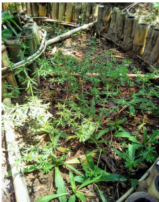
Saw toothed Coriander, one of the new herbs showing promise

The plot continues to serve as a place for trying new ideas. We have continued to experiment with the indigenous species of Artemisia afra to strengthen what we have already been promoting with Artemisia Annua . The farm is well labelled so that it becomes a resource for learning, including both the local or indigenous species, with local names, and the exotic introduced species.