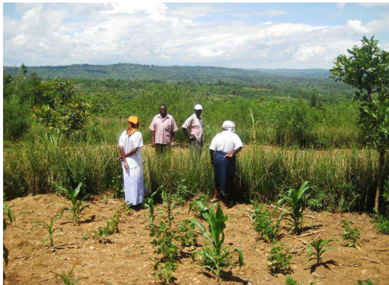
Vetiver hedge well planted on a contact's farm

Although we have not been able to go out and promote it as actively as we had planned, during this year, REAP has continued to promote Vetiver Grass and a number of those we have trained have been teaching on its use for soil conservation. Our substantial Vetiver Grass nursery is a local source of planting material. One of our contact pastors reports that many local teaching sessions having been conducted and we still promote small local Vetiver grass nurseries. This has had the greatest adoption in the Butere and Mumias areas of Western Kenya, where a significant number of farmers are protecting their land with Vetiver grass. We have however had enquiries from further afield and have been able to send planting materials to various parts of Kenya through courier services, and to share teaching on the value and planting of the grass over the phone or through local contact people we have trained in the past.