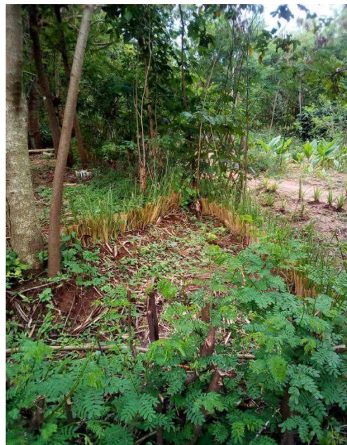
Leucaena in the REAP farm

We have continued to maintain and improve the paths and routes round the farm for the benefit of visitors while consolidating the production areas. Since the farm has been laid out with paths, visitors can be taken on a route round that plays to their interest. The main areas of interest are natural medicines, care of the soil including Vetiver Grass for erosion control, and for general environmental care which we teach as Creation Care. The whole garden has taken on an internal logic with a good flow for visitors coming to learn or just to see, and we believe better use of the available resources.