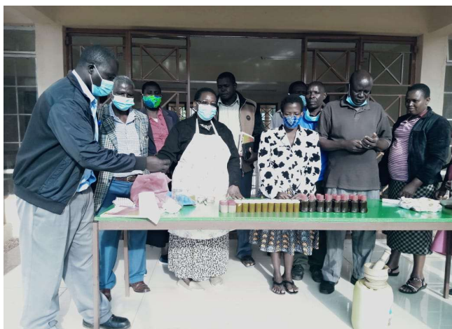
Seminar at AIC missionary college, Eldoret

At a more local level non residential seminars have been organised by various churches and REAP staff have been able to facilitate with teaching on a range of topics. Two of the REAP staff conducted a five-day seminar in May 2021 for the students of the Africa Inland Church Missionary College in Eldoret. Although this training covers the range of the teaching we normally give, it has an extra focus on how Natural medicines can facilitate mission outreach.