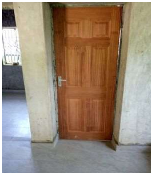
Interior of Kajulu building showing tiles and doors

During this year work has been undertaken on the building, with the completing of tiling of the floors and the fixing of internal doors making the building much more conducive for training and enabling its use as the field office. During the year the office in Kisumu town was closed and the function moved to the farm. This practical teaching base is dynamic and new ideas are tried and those that have potential are incorporated into the farm.