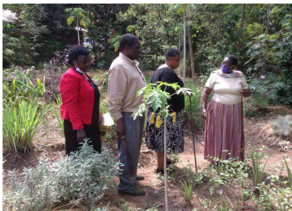
Recent trainees visiting the REAP farm

During this year work has been undertaken on the building, with the completing of tiling of the floors and the fixing of internal doors making the building much more conducive for training and enabling its use as the field office. During the year the office in Kisumu town was closed and the function moved to the farm. This practical teaching base is dynamic and new ideas are tried and those that have potential are incorporated into the farm.