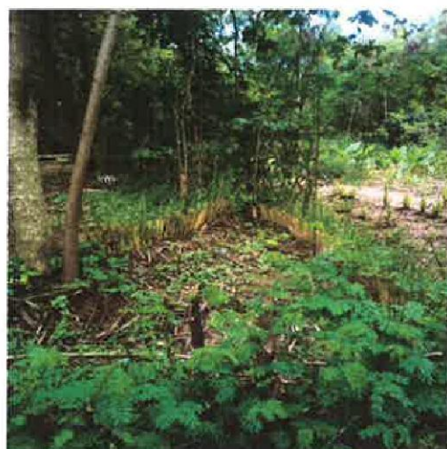
Leucaena trees on the farm, ready for harvest

As we have developed our teaching in relation to the value of leguminous trees in the garden, we have also been harvesting those trees that have grown to the stage of being a nuisance. This year we have been experimenting successfully with making charcoal from the larger Leucaena trees, most of which are self sown and have been left until the shade becomes a problem. We are thus encouraging the planting of Leucaena for improving the fertility of the land, for soil conservation, for animal fodder and when thinning the excess can be used for charcoal making. We have used local methods of making charcoal and are now looking at a simple kiln for more efficient production.