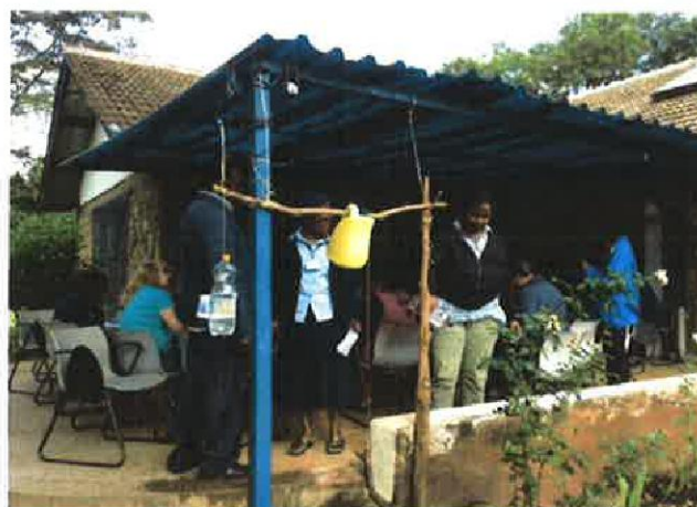
Teaching on Tippy Tap

One focus we have had in REAP has been on the use of available resources that can be found in rural communities. We have for a number of years included teaching on making the tippy tap and the hand washing bottle. When the news of Covid19 reached Kenya one of the main messages was the importance of hand washing. It was therefore very encouraging when many of those whom we have trained spontaneously started actively teaching on the making and use of the tippy tap. We have had many reports of how people responded in the first few weeks of the pandemic to this teaching, and it continues to be shared.