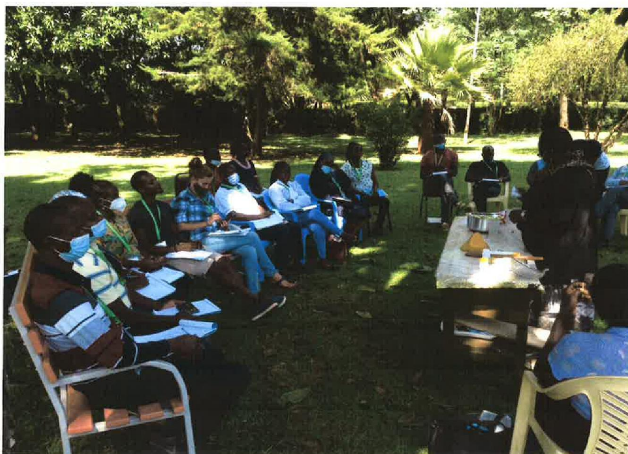
Training seminar in Subiaco

By March 2020 Covid19 had reached Kenya, so we were able to start discussions on how the teaching we have been giving relates to the pandemic. We have always emphasised the value of Natural Medicines for general health and strengthening the immune system, and this has been the basis of our specific response to the pandemic. In this respect our focus upon Artemisia annua is seen as particularly relevant, as well as locally available technologies. We developed the thinking further during the February 2021 seminar.