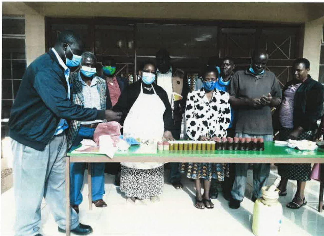
Seminar at AIC missionary college, Eldoret

At a more local level non residential seminars have been organised by various churches and REAP staff have been able to facilitate with teaching on a range of topics. Two of the REAP staff conducted a five-day seminar in March 2021 for the students of the Africa Inland Church Missionary College. This training covers the range of teaching we normally give, but with an extra focus on how Natural medicines can facilitate mission outreach.