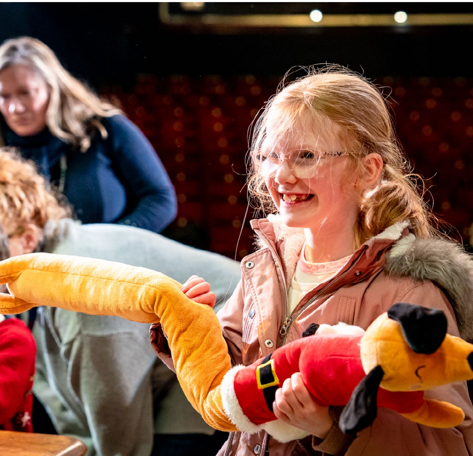
Image: Audio description is a key part of accessible theatre for adults but isn't common in children's theatre. With our funding, Wimbledon children's theatre, Polka Theatre, has been able to increase the number of audio-described performances on offer to visually impaired children and their families. It has also enabled them to share touch tours of their performances – as pictured here.