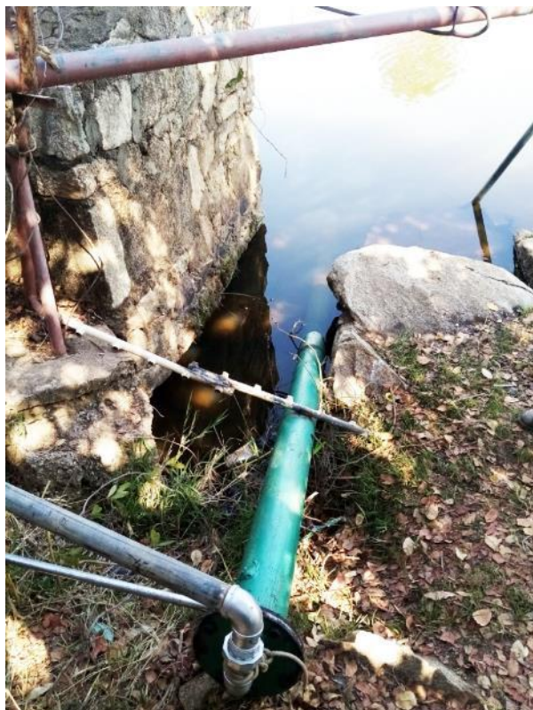
Water inlet from river