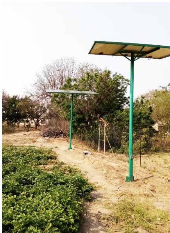
Solar panels to power water pump