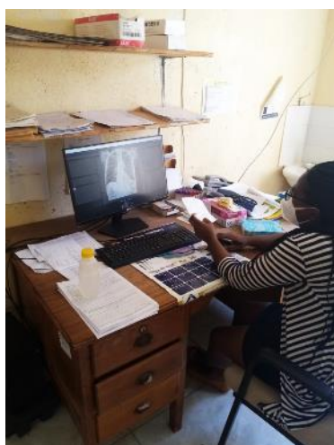
A doctor using a terminal in OPD

The hospital is looking at linking the X-ray department with some essential points including clinicians workstations in General side, Theatre and OPD including the doctors' offices. We managed to set three X-ray viewing points for the Clinicians thus in theatre, General side and OPD in doctors' office.