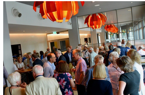
2019 Season Launch reception at The Apex Hotel

Bath Philharmonia benefits from a wonderful community of Friends, Patrons and Benefactors whose valuable support and philanthropy provides an essential lifeline to the continuation and development of the Orchestra's concert and creative programmes. Although our schedule of members' events was cut short by Covid-19, a successful Season Launch and two pre-concert receptions did take place and enabled staff, trustees and musicians to meet and thank members.