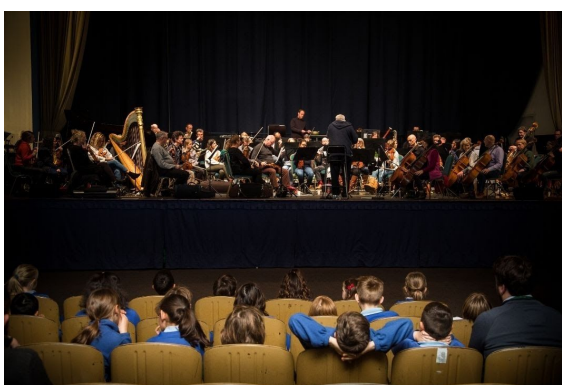
School group listening to 5th Dec 2019 rehearsal