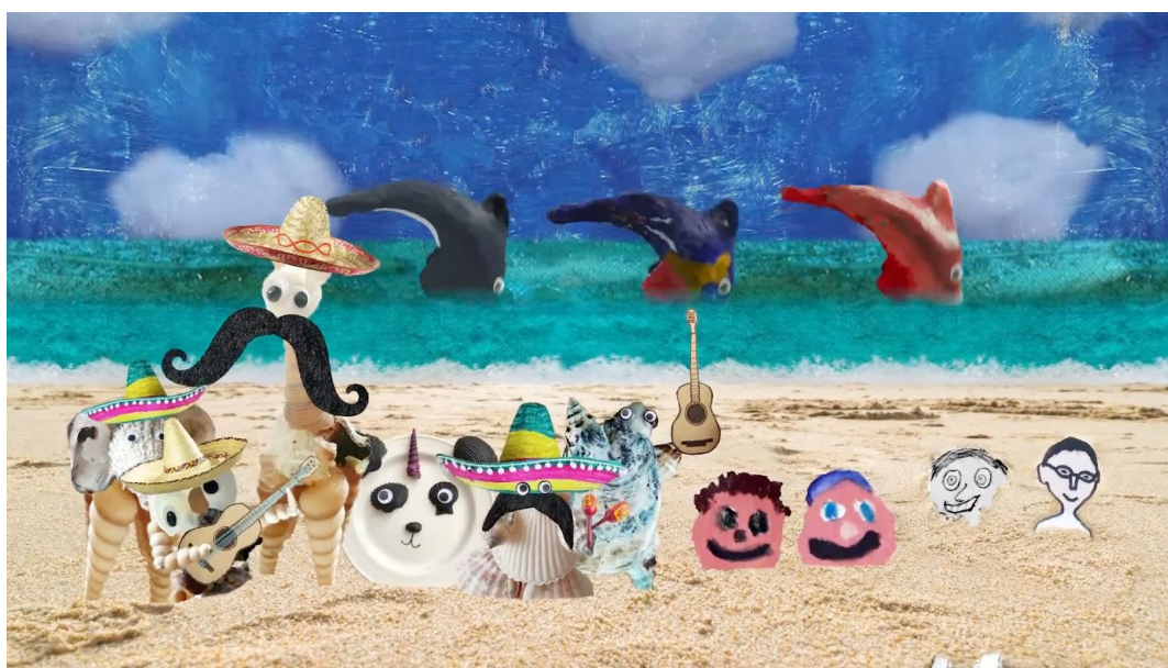
Still from B&NES Young Carers music video 'The Beach', the first music video in our Lockdown Sessions.