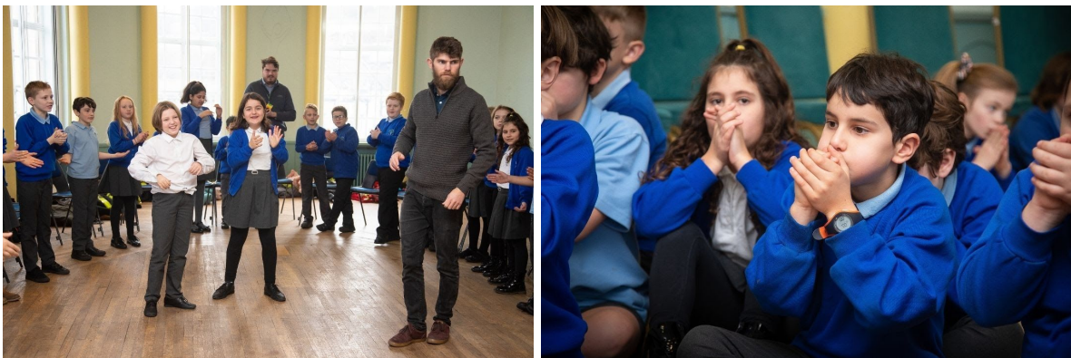
St Andrew's Primary School workshop on 5th Dec 2019, The Forum

Having attended our orchestral rehearsals, 59 pupils (Year 4 & 5) from St Andrew's Primary School in Bath, our Creative Learning Team led a series of school based creative composition workshops. Taking Anna Clyne's Night Ferry as a starting point, the children created their own musical fantastic journey performed to the wider school community.