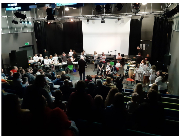
Plymouth Young Carers Concert on 1st Mar 2019, Marine Academy