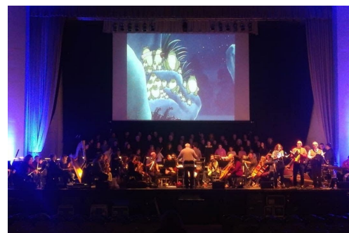
Rupert & The Frog Song, 19th Dec 2019

In December 2019, Bath Philharmonia performed the premiere performance of George Martin's score to 'Rupert & The Frog Song' live to film featuring a specially-formed choir comprising Bath Community Gospel Choir and 30 Young Carers.