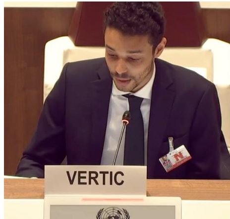
Preparatory Committee for the BWC Review Conference, Geneva, April 2022

Legislative Assistance for National Implementation of the Biological and Toxin Weapons Convention and the Chemical Weapons Convention, funded by the Norwegian Ministry of Foreign Affairs.