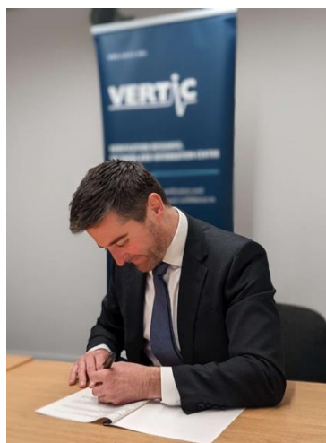
VERTIC signing agreement with IAEA

VERTIC's institutional partnerships have grown during the reporting period. In December 2021, we signed an organisational-level agreement between the International Atomic Energy Agency and VERTIC, formalizing the approach to cooperation on nuclear safeguards. As anticipated and described above, we cooperated extensively on the development and execution of flagship elements of the 2022 IAEA International Safeguards Symposium.