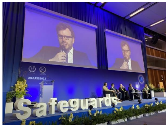
VERTIC at the IAEA Symposium on International Safeguards, 2022

In addition, VERTIC provided support to the IAEA for the 2022 Symposium on International Safeguards. VERTIC staff contributed to the formulation of the symposium's scientific programme and to the creation of a 'futures' tool investigating different trends and scenarios relevant to the IAEA Safeguards regime over the next 35 years.