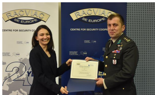
BWC Workshop, RACVIAC Centre for Security Cooperation, May 2022, Croatia

In this project, the NIM team has completed comprehensive analyses of legislation and continued to publish revised and translated versions of its awareness-raising and legislative analysis tools on BWC and CWC implementing legislation. The team participated in remote and in-person events, conducted outreach, preliminary and follow-up activities for legislative analysis and drafting in interested countries, in coordination with relevant partners.