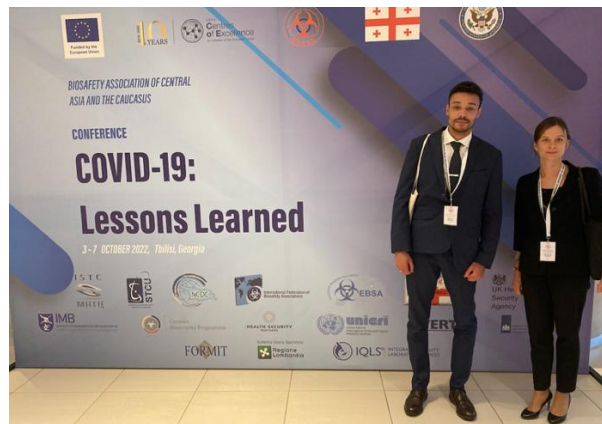
BACAC Conference 'COVID-19 Lessons Learned', 3-7 October 2022, Tbilisi, Georgia

Under this project, the team prepared for and delivered pre-conference workshops, a roundtable discussion and a conference session on legislation during the BACAC conference on “Covid-19 Lessons learned” during 3-7 October in Tbilisi, Georgia.