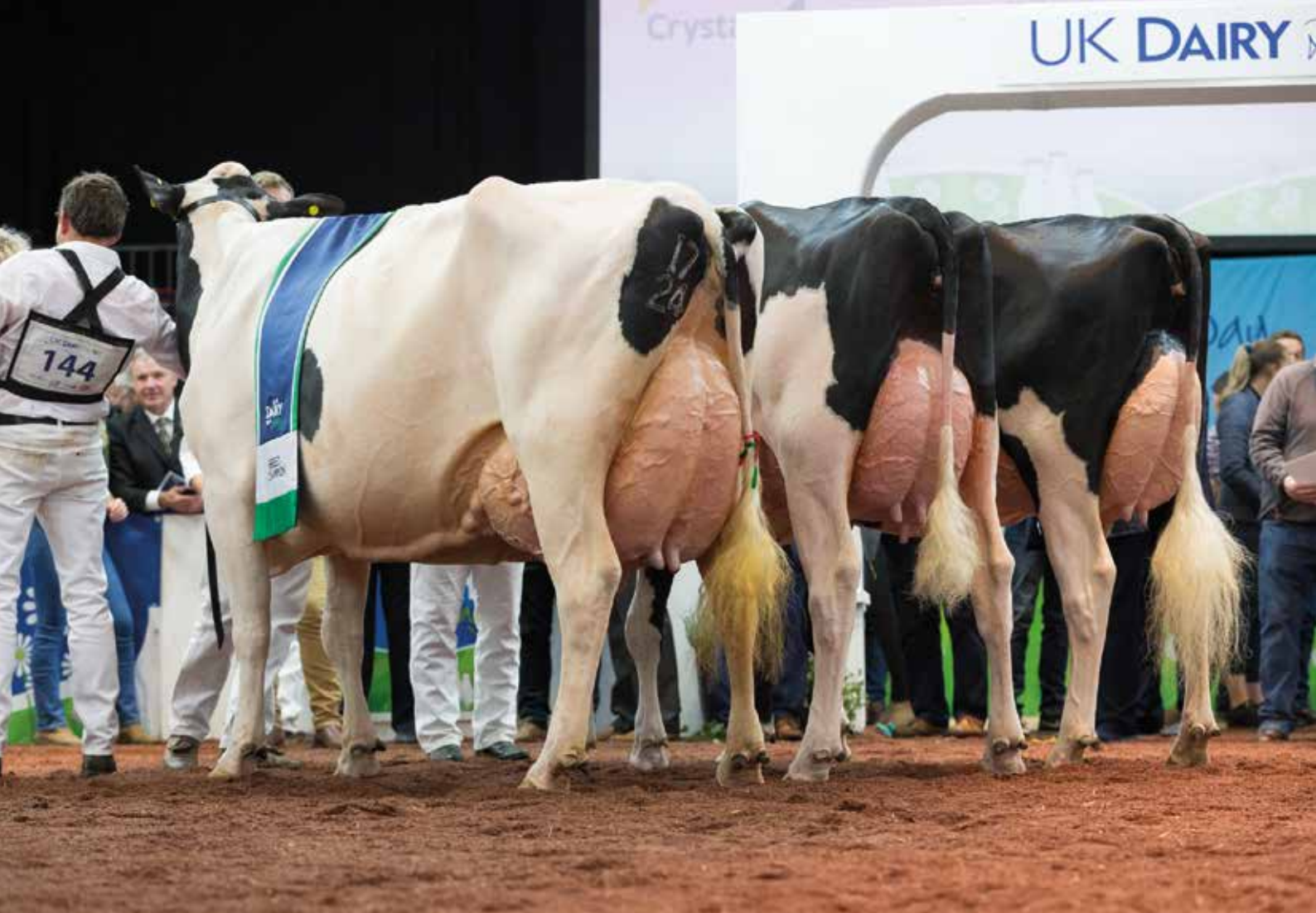
Holstein National Show Championship - Champion Styche Armourhill Gonda, R. Champion Wilt Bailay, H. Mention 5Guys Blexy Black Raptor