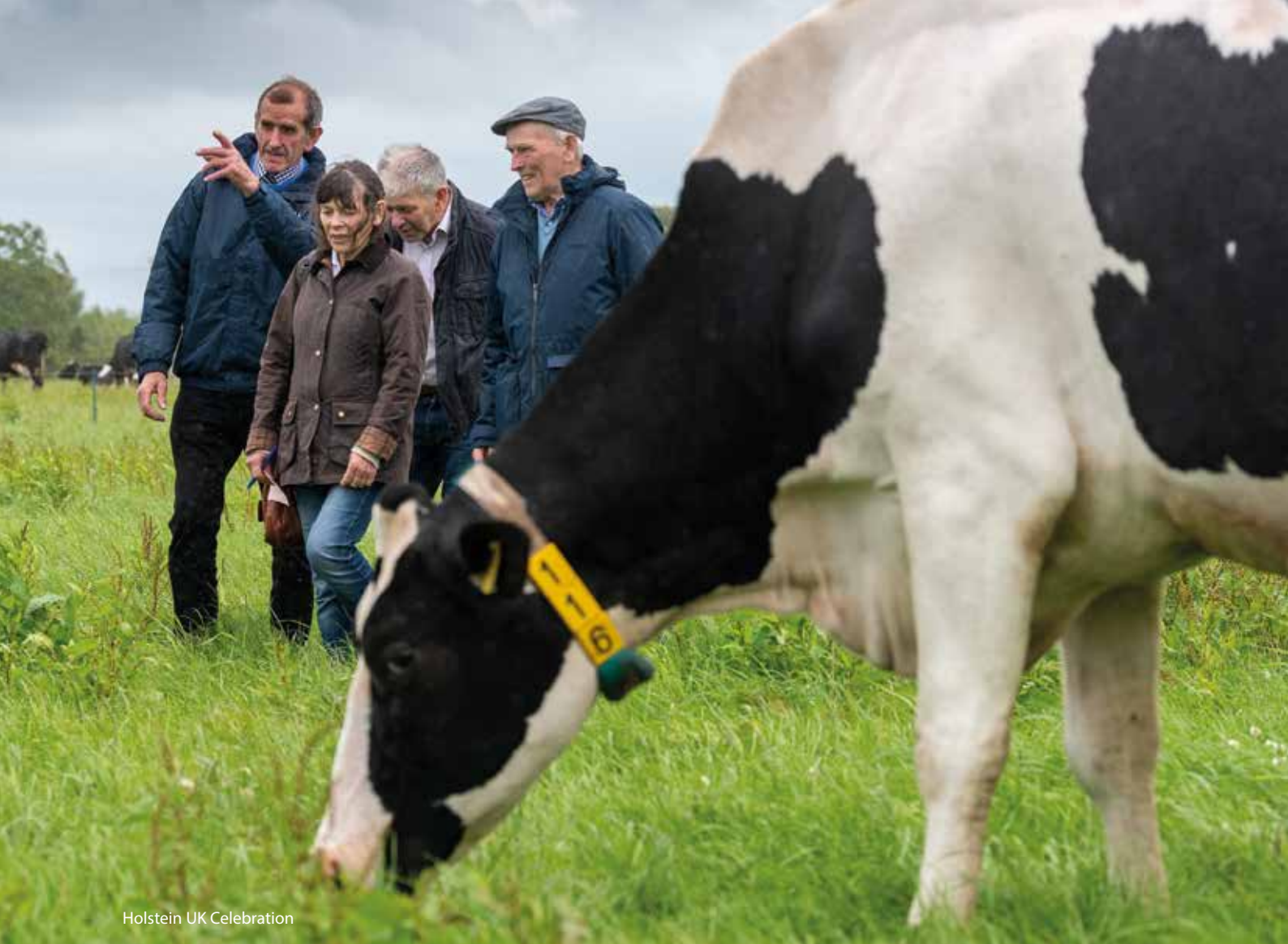
Holstein UK Celebration

The main risk to the Charity's financial position would be CIS ceasing to gift aid sufficient profits to enable Holstein UK to achieve its charitable objectives. This is a risk which is reviewed by the Trustees at the quarterly board meetings. The services delivered by CIS are constantly reviewed with new products developed to meet changing needs and protect market share where appropriate. Spend within Holstein UK is also under constant review to ensure maximum return is received for each pound expended.