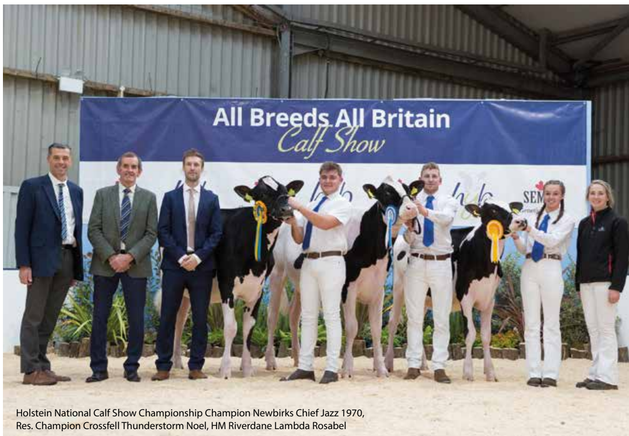
Holstein National Calf Show Championship Champion Newbirks Chief Jazz 1970, Res. Champion Crossfell Thunderstorm Noel, HM Riverdane Lambda Rosabel

Representing Holstein UK at events, conferences and meetings to promote our members' views and the Society.