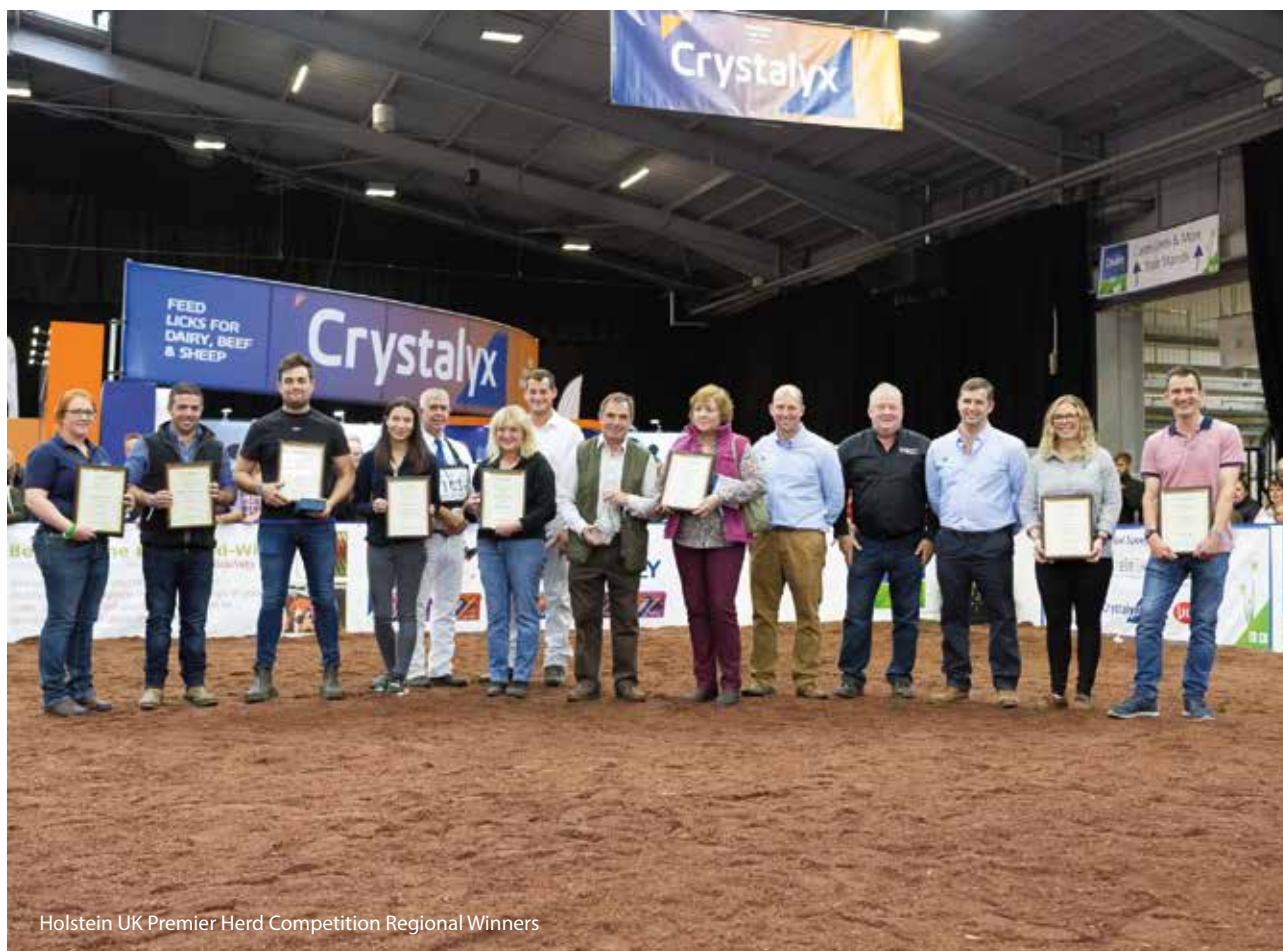
Holstein UK Premier Herd Competition Regional Winners