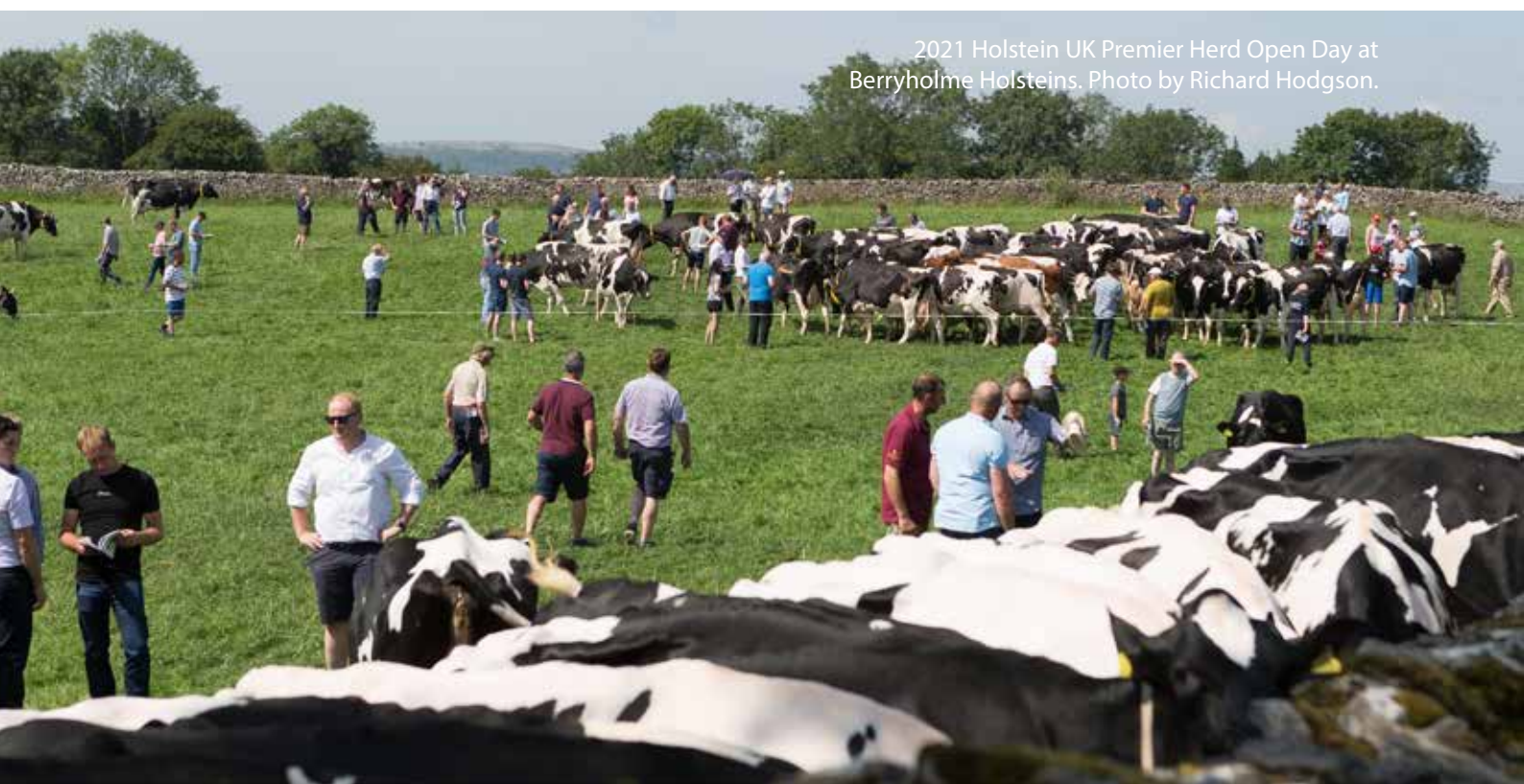
2021 Holstein UK Premier Herd Open Day at Berryholme Holsteins.