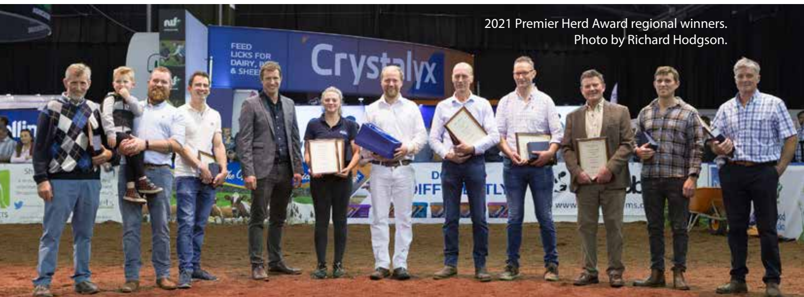
2021 Premier Herd Award regional winners.