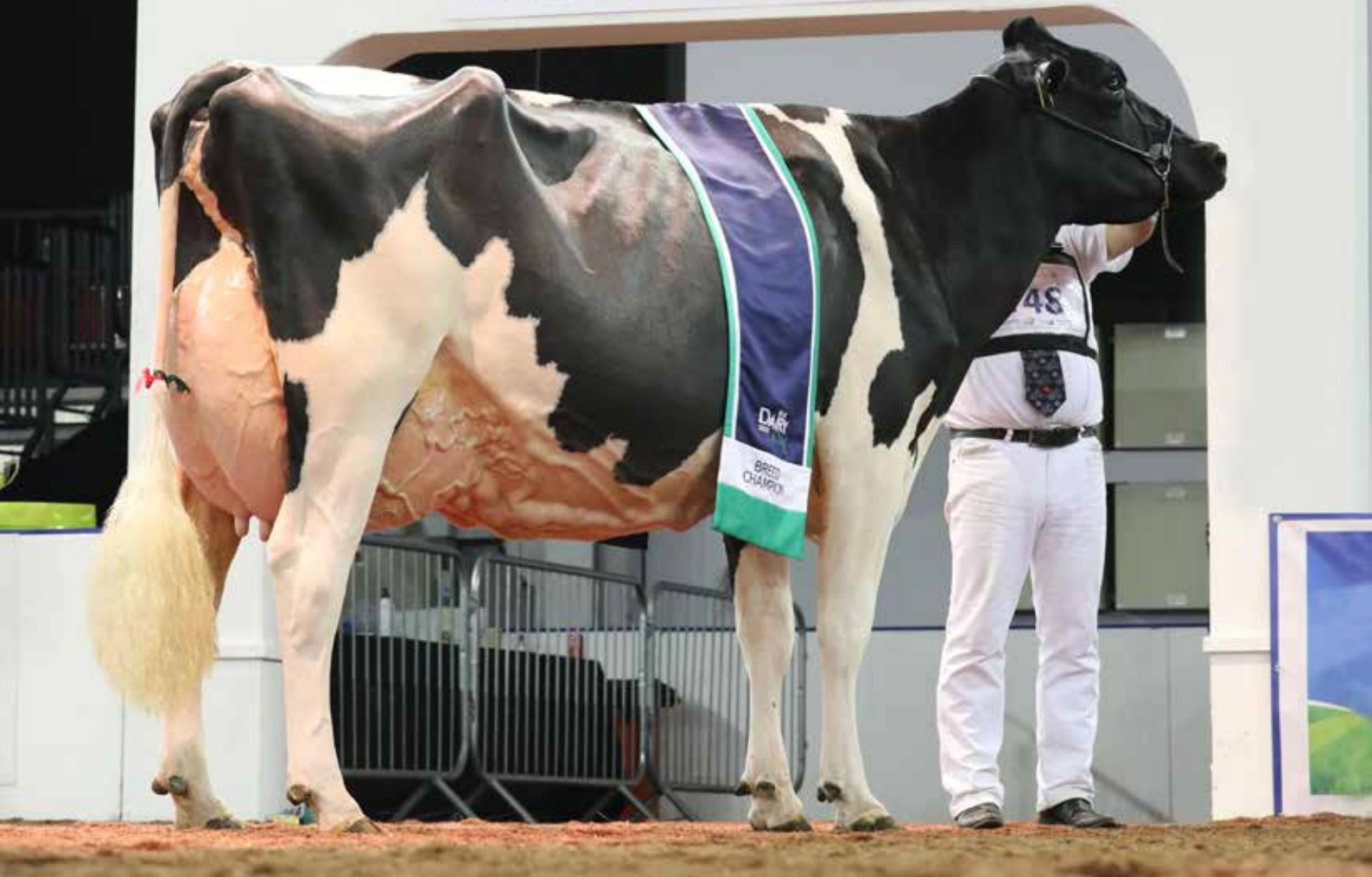
Holstein UK National Show Champion Riverdane Absolute Springsteen (Apples Absolute Red), Riverdane Holsteins.