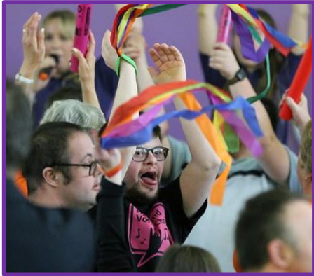
Hands & Voices members performing at our 'Can We Ceilidh? Yes We Can!' Gig in October '23

When asked to explain why they feel our projects are important, they told us: