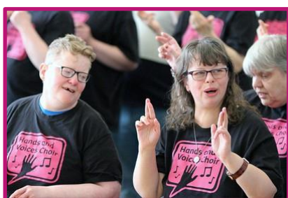
Hands & Voices members performing at our Social Showcase

A fully inclusive singing and signing community choir, set up in 1997 to help adults with communication and learning difficulties take part in performances. The Hands & Voices programme includes regular choir rehearsals, performances and outreach workshops co-led by Hands & Voices trainees (members of the choir who are learning how to lead workshops).