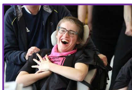
Members of Movers & Shakers, IMPs and Hands & Voices performing at our Spring Social Showcase