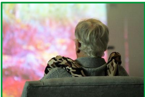
Someone relaxing in iMUSE. They're wearing 'The Hugger' a wearable vibro-acoustic device to aid relaxation, designed by a long-term iMUSE participant

iMUSE is a portable interactive multi-sensory environment. It provides a relaxing, therapeutic and creative space where participants can connect with the world around them, make their own choices, reduce anxiety and stress and develop non-verbal ways of communicating. It combines relaxation (using vibro-acoustic technology), music and visuals in one-to-one sessions tailored to each individual's needs and preferences.