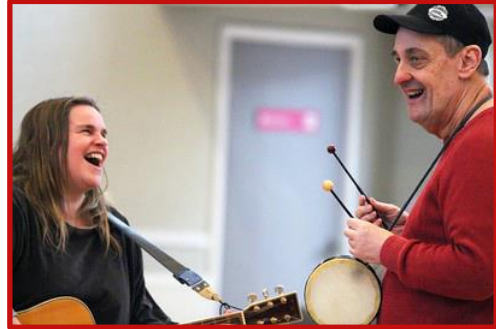
Making music at Movers & Shakers

Creative and sensory-based activities designed for adults with profound and multiple learning disabilities (PMLD). Activities are designed to help participants develop communication, motor and learning skills. They include music making, movement/dance, mindfulness activities, storytelling and drama, alongside lots of opportunity for positive social interaction. Movers & Shakers meets weekly during term-time.