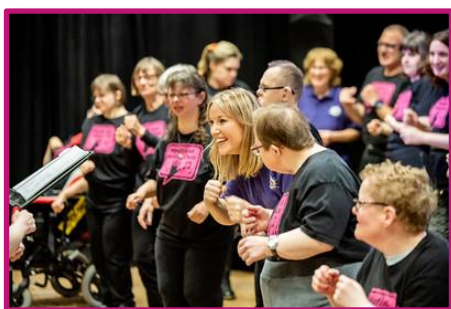
Hands & Voices performing at our Big Birthday Bash

A fully inclusive singing and signing community choir, set up in 1997 to help adults with communication and learning difficulties take part in performances. The Hands & Voices programme includes regular choir rehearsals, performances and outreach workshops co- led by Hands & Voices trainees (members of the choir who are learning how to lead workshops).