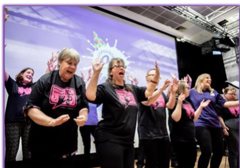
Hands & Voices performing

A social media campaign celebrated highlights from the last four decades and our birthday celebrations culminated in a special anniversary gig at York St John University in October.