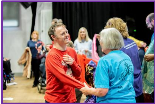
Movers & Shakers participants performing at our Big Birthday Bash

When asked to explain why they feel our projects are important, they told us: