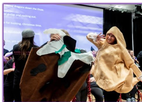
Remembering dressing up for Christmas busking in "We're AAM, How's At"