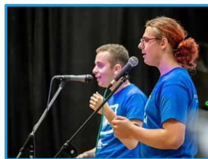
Senior IMPs members performing at our Big Birthday Bash

IMPs offers year-round fun, inclusive music activities for disabled and non-disabled children and young people aged 5 – 25. The IMPs programme includes weekly sessions during term time (Senior IMPs for young people aged 11+ and Junior IMPs, delivered in partnership with Westfield Community Primary School), holiday activities in all the school holidays except Christmas, and a training programme where participants learn leadership, planning and communication skills. We also deliver outreach workshops in schools, youth groups and other community settings, co-led by our IMPs trainees.