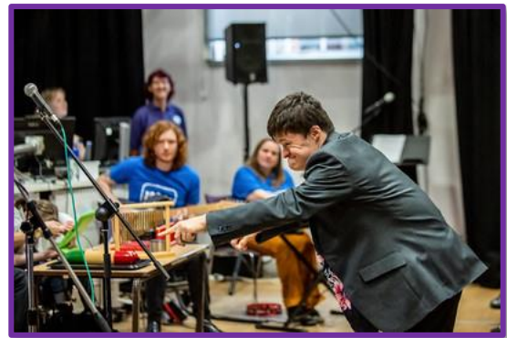
IMPs members performing at our Big Birthday Bash