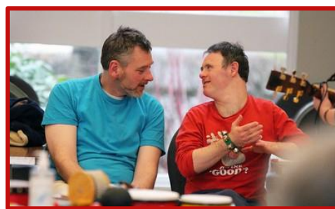
Making music at Movers & Shakers

Creative and sensory-based activities designed for adults with profound and multiple learning disabilities (PMLD). Activities are designed to help participants develop communication, motor and learning skills. They include music making, movement/dance, mindfulness activities, storytelling and drama, alongside lots of opportunity for positive social interaction. Movers & Shakers meets weekly during term-time.