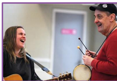
A Movers & Shakers session

“I'm always happy at Movers and Shakers because I love the music and company. I'm more vocal when I sing to music and am very excited. I'm a happy soul.”