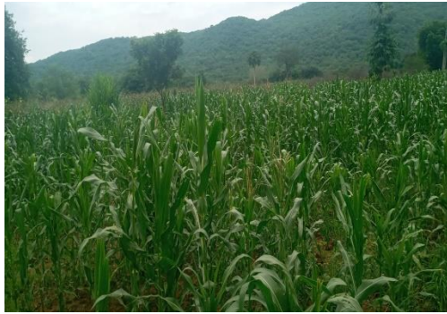
Maize in February 2021 before harvesting