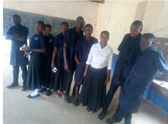
Second Year Electrical Students

Feedback from past students shows that they have all ended up with very good, well-paid jobs. Many of the electrical students end up working for TanESCO, the state power company equivalent to UK's National Grid.