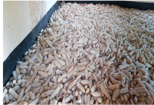
Harvested maize drying

Whilst most of the College students pay annual tuition fees of TSh 700,000, about £280, we continue to sponsor 10 of the 35 College students who are orphans or from very poor families, through the generous, regular donations from our sponsors. These include 6 students sponsored by TWOAT, the Tadworth and Walton Overseas Aid Trust. In addition to the older College students, half a dozen young orphans live at the College and are sponsored to go to the village Primary and Secondary Schools.