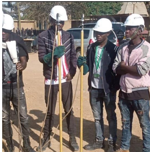
Past Electrical Students

Feedback from past students shows that they have all ended up with very good, well-paid jobs. Many of the electrical students end up working for TanESCO, the state power company equivalent to UK's National Grid.