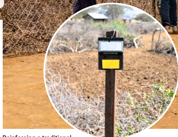
Reinforcing a traditional livestock enclosure. Inset: a predator deterrent light

To further enhance lives, we distributed 34 solar light units and 17 water storage tanks to each of the new and repaired bomas, while the repaired bomas each received 24 'jikos' (energy saving stoves). Since our programme began, 7,726 jikos, 485 solar lighting units, and 291 water storage tanks have been distributed.