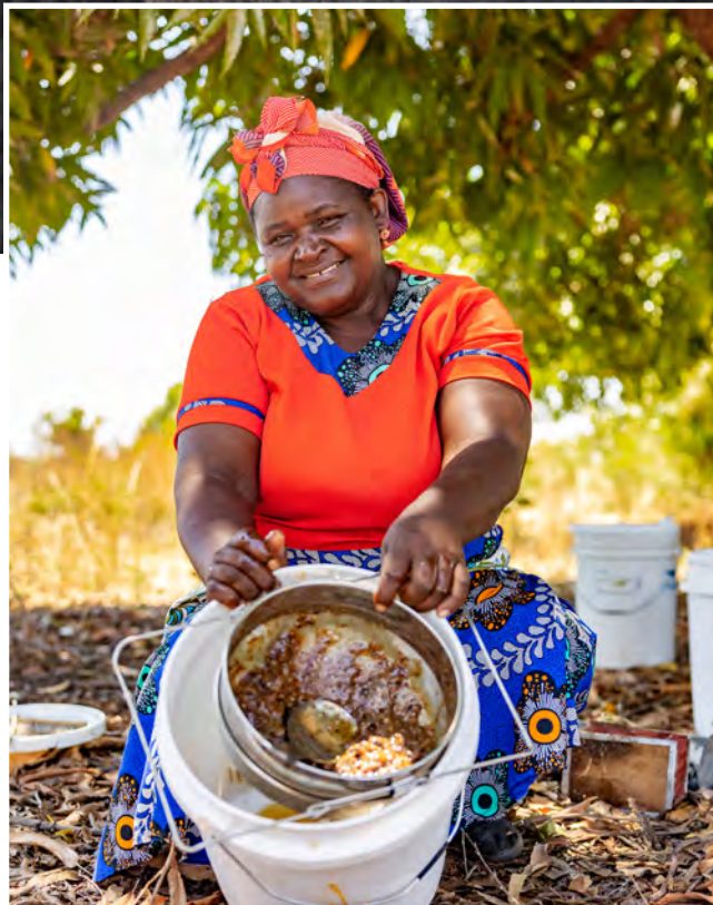
Harvesting honey from our beehive fencing