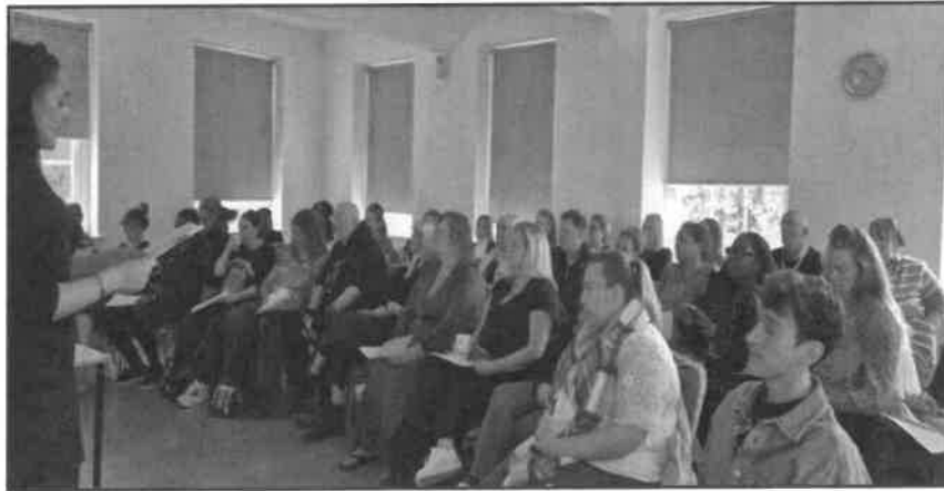
Our October Open Forum on Young People and talking about Misogyny

We also had a holiday celebration last December for women and their children with 85 attending for food, games, dancing and presents. In August we took 62 women and children to Broadstairs beach for the day. Both events were very popular even though the weather was a bit grey in Broadstairs this year!