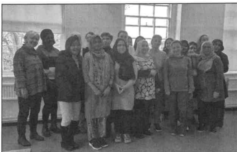
Our English Students and Teachers - December 2024

Our basic English ran 3 courses 3 times a year with 156 attending over the year. We also ran our confidence building course for 14 women and our parenting workshops for 19 women. Our Community Champions brought in women from their communities to attend both our health awareness sessions and a money management session, with 197 attending over 3 events.