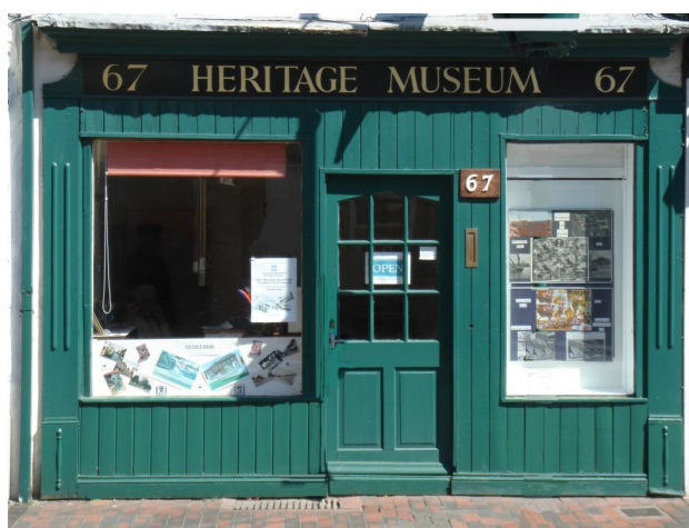
The Museum, 67 East Street

Please tell your friends and relatives about us so that they might also help us to keep a museum in Sittingbourne.