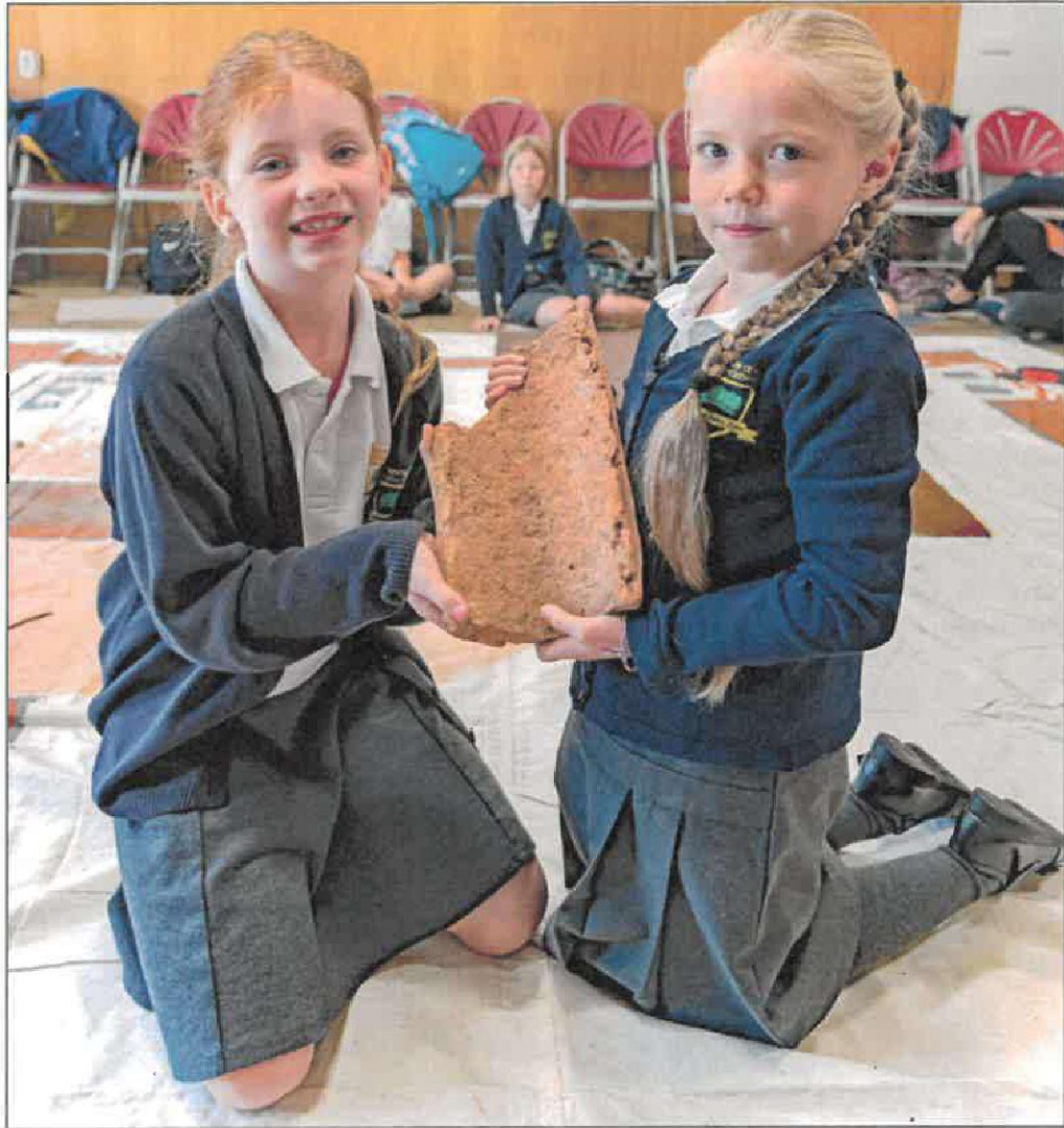
Pupils from Pimperne CB VC Primary School show off a piece of Roman roof tile they discovered during the Indoor Dig at the museum.