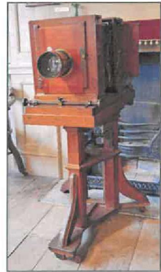
Some of the artefacts which inspired the performance.