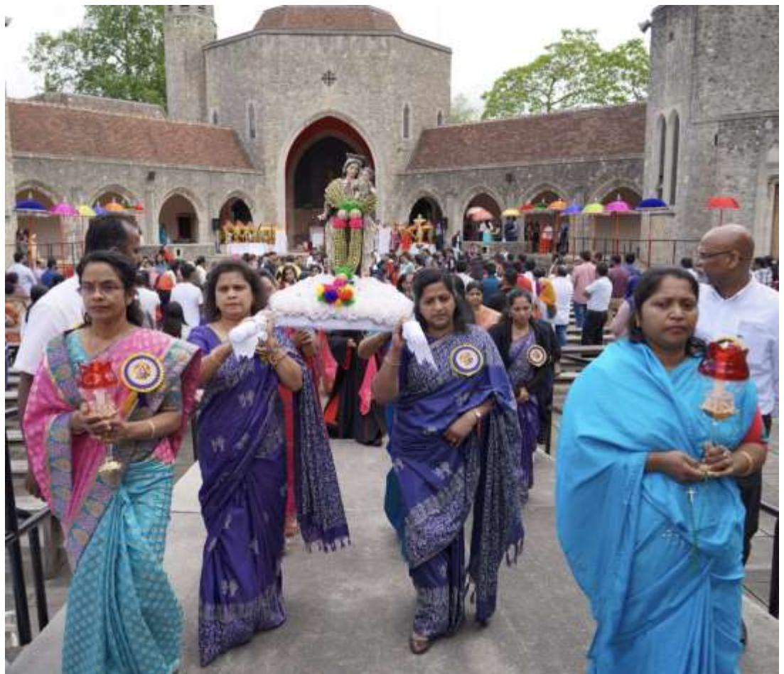
Syro-Malabar Procession of Our Lady of Mount Carmel in May

The Polish Pilgrimage continues to be one of the biggest which attracted almost 2,000 people. Other pilgrimages included the Tamils, Italian, Divine Mercy, Caribbean, Goan, Filipino, Kerala Catholic Chaplaincy and Knights of St Columba.