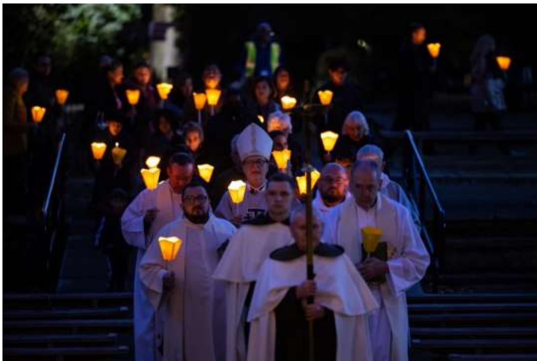
Night procession along the Rosary Way