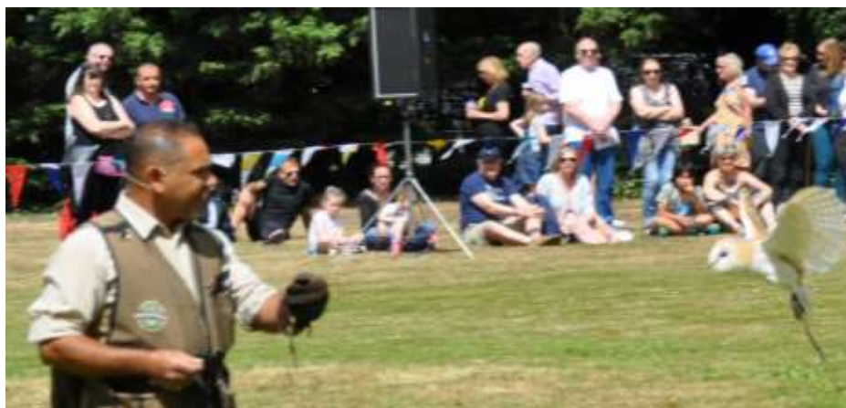
Birds of Prey Display at Summer Fayre 2022