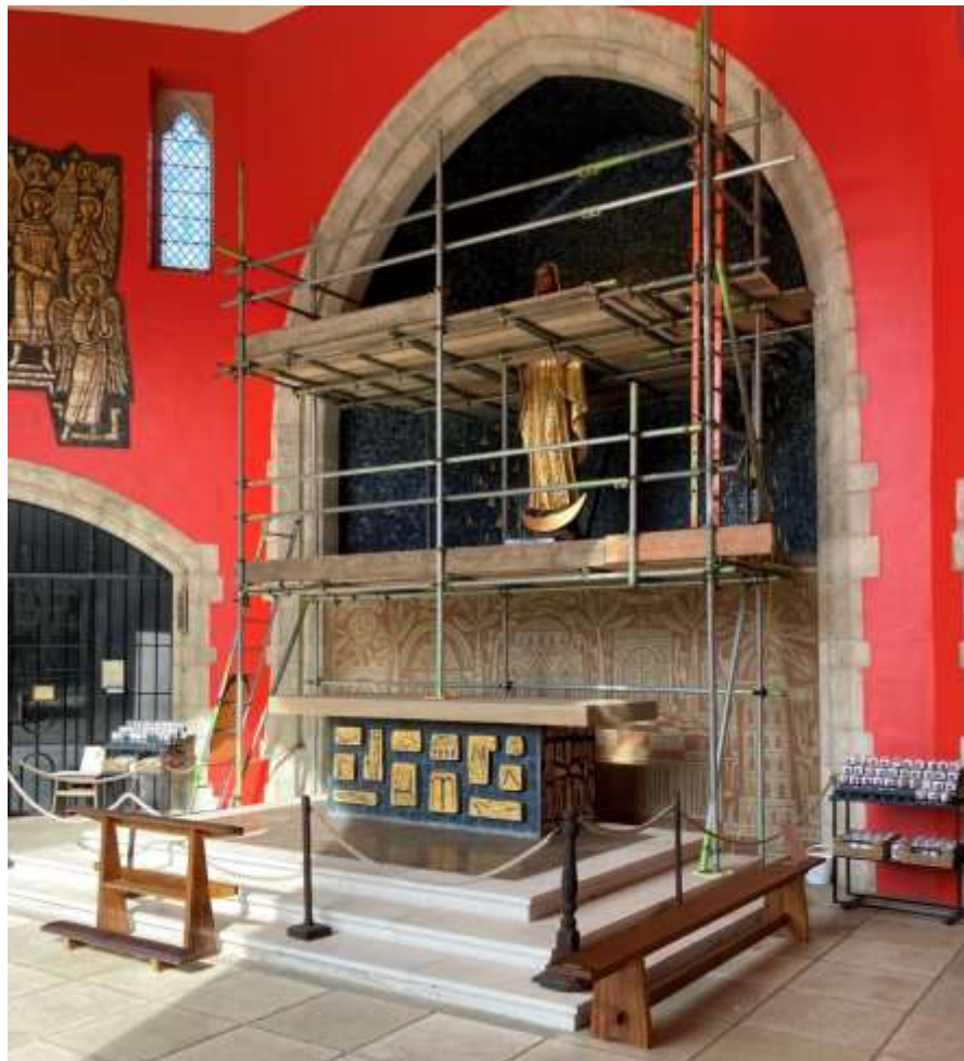
Ongoing regilding works on the statue of Our Lady

We replaced the 25-year-old steam boiler and two pieces of laundry equipment.