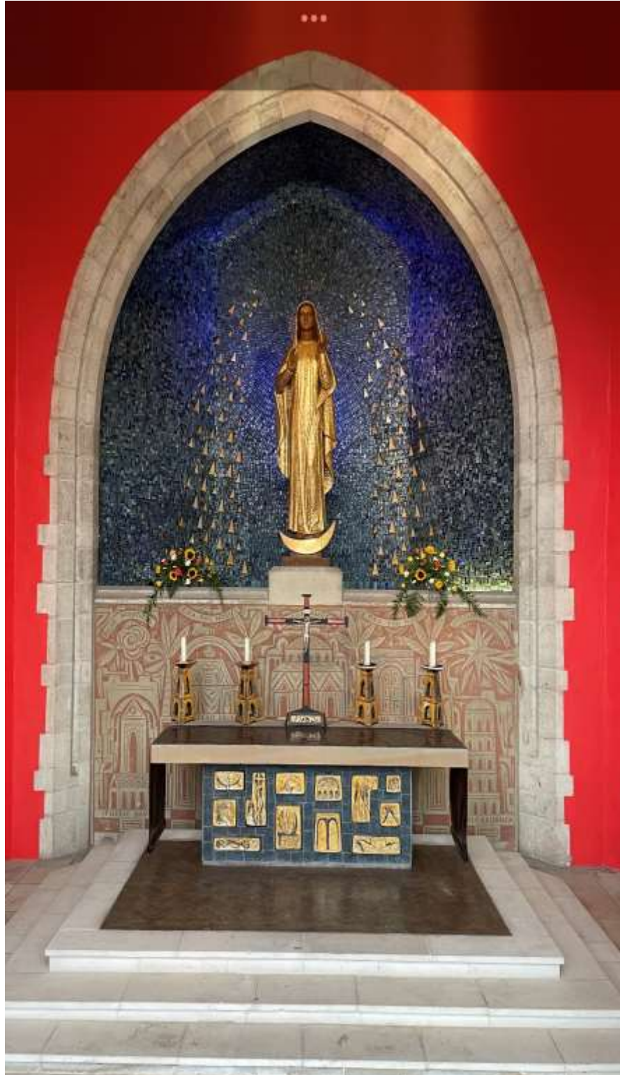
The finished work on the statue of Our Lady