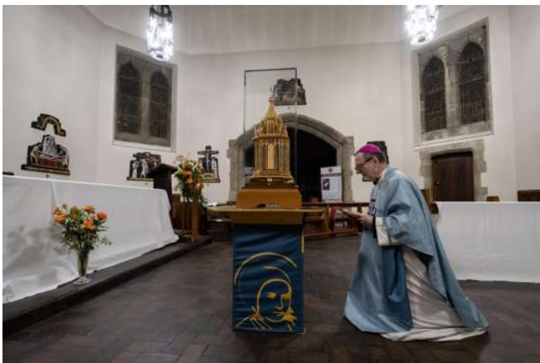
Veneration of the Relics