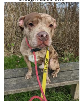
Ralph, one of many taken from another 'rescue' who was living in a crate all day.