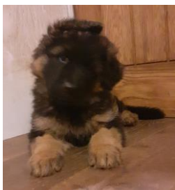
One of the many animals left at vets when owners could not afford to pay the bill.

We continue to rescue dogs from Ireland and Romania as well as locally. This year we started to do mandatory testing for Brucellosis for all dogs from Romania prior to travel. Most veterinary practices now demand proof that dogs from mainland Europe have been tested for this disease and are negative before they will treat them because it can be passed to humans. This is in addition to the tests we already carry out for tick borne diseases.