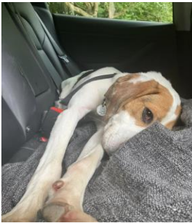
Jacob returned to us after less than 24hrs because he kept jumping on the couch.

Animals, especially dogs, need time to settle into their new homes. Many are anxious when moved on again, and we have been shocked and disappointed by how quickly some of our animals are returned. One dog, a foxhound called Jacob, was returned in less than 24 hours because he was restless. Another, a crossbreed called Lizzie, was returned after a couple of days when they decided she was too big for the house. This is very disappointing as we go to great lengths to ensure potential adopters have a clear understanding of what is needed when taking on a new pet. We offer back-up training too but still people give an animal up without asking for help.