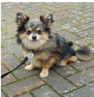
Vinnie, a traumatised pup from an unscrupulous breeder