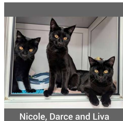
Nicole, Darce and Liva

We are still receiving calls via our helpline for help with cats which often only need microchip and spay/neuter, but householders are not being successful when seeking neutering vouchers via the local Cats Protection. Some of our work in reuniting lost cats has been made more difficult causing wasted time and fuel, due to microchips not being kept up to date.