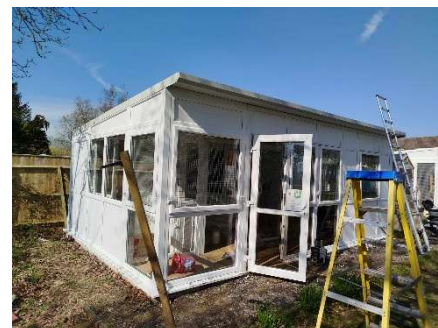
Our new ISO pod under construction

Many thanks to our Trustees, Executive Committee Members, Bid Funding Team, volunteers and supporters who make it possible for us to do what we can to help the cats and kittens.