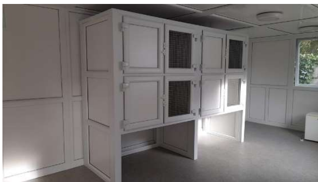
Interior of our new Mother and Kitten unit