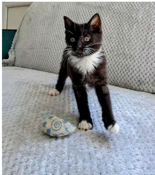
Hope, one of the first residents of our new Mother and Kitten unit

We are striving our hardest to help the colonies we have visited in the past, some of them are proving quite hard to capture!