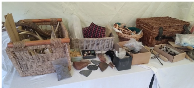
The experimental tent