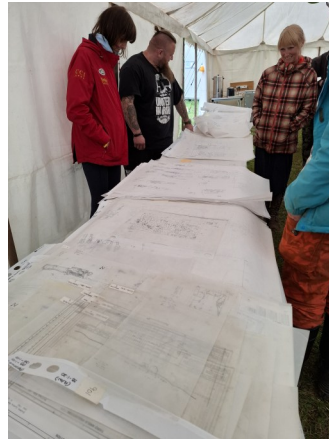
The archive team getting to grips with decades of records