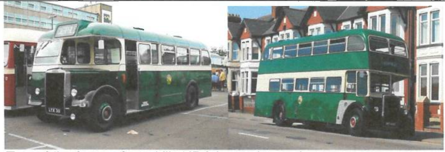
Two of the former Caerphilly UDC buses housed at Barry which would have starred in the Caerphilly 100 celebrations had Covid 19 not intervened.

The “Bus Depot” at Broad Street, Barry had been open to visitors on Fridays and Saturdays up until the initial lockdown in March. Free entry was available to view a selection of the Groups collection and the progress being made with the restoration of certain vehicles.