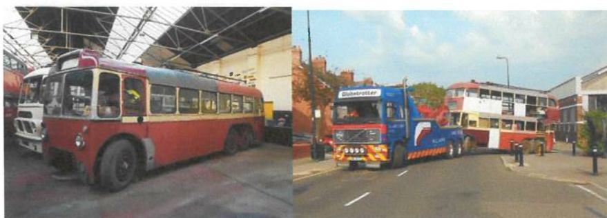
Cardiff single deck trolleybus 243 new in 1955 safely inside "The Bus Depot" at Barry where restoration can continue and arriving a week later was double deck trolleybus number 262.

Trolleybuses, electric vehicles that draw their power from overhead cables, ran in Cardiff from 1941 until 1971. The Cardiff & South Wales Trolleybus Group which was formed in 1992 to preserve examples of Cardiff trolleybuses relocated to "The Bus Depot" in September 2020 after a fire destroyed their previous premises and almost claimed their two vehicles under restoration. The trolleybuses fill a vital gap in the history of public transport in Cardiff and therefore complement the CTPG collection for visitors to Barry to enjoy.