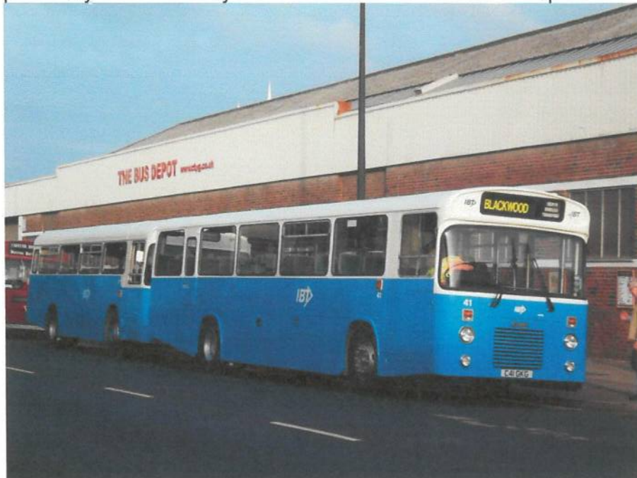
This former IBT Leyland Tiger joined the CTPG collection during 2020.

The Charities policy of adding further representative vehicles to its collection saw one additional vehicle purchased in 2020. C41 CKG is a former Islwyn Borough Transport Leyland Tiger with bodywork by East Lancs new in 1985. Fully restored and at a very reasonable price, it had previously been owned by a CTPG member who wished to dispose of it.