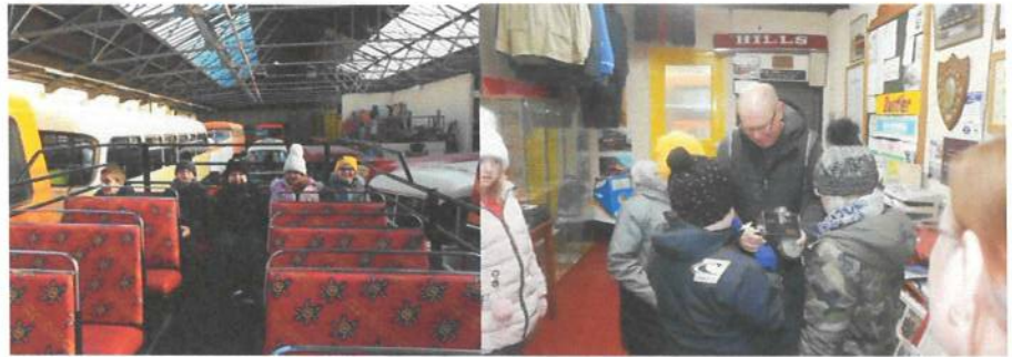
Pupils from Llanmartin Primary School pose for the camera on the top deck of an open top bus and being shown the workings of a manual ticket machine on their visit to “The Bus Depot”

Prior to lockdown, the Charity continued to support local schools with transport related studies. A group of special needs children from Llanmartin Primary School were given a guided tour of “The Bus Depot” on 20 January 2020.