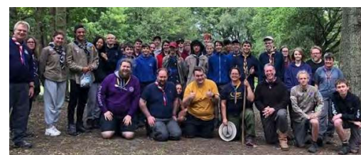
The first county Young Leader Bushcraft camp at Polyapes, July 2023

Finally, a number of our Young Leaders star in several videos promoting the Young Leader scheme on the Surrey Scouts website. See if you can spot anyone you know!