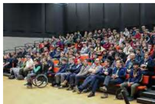
Young Leaders from Esher and across the county at the Conference in March 2024