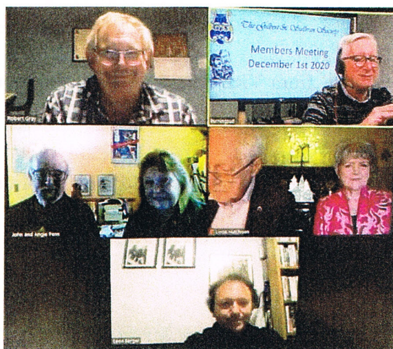
The Team setting up a Zoom Meeting