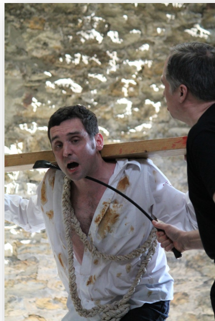
STATIONS