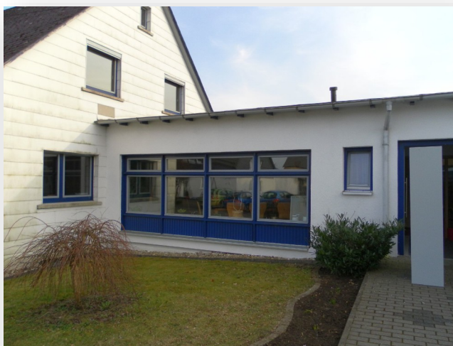
The former CP house in Stahlhofen am Wiesensee, Germany.