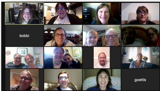
Classes, devotions and celebrations on Zoom!

We were faced with several significant logistical complications this year. Many organisations were only starting to return to running a regular programme post-COVID, even so, some were still hesitant to plan events and have guests.