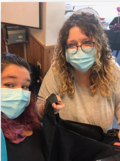
Masked up and ready to go!

W e also had responsibility for the selling of Covenant Players home and office in Stahlhofen am Wiesensee , near Westerburg in Germany. We made many trips backwards and forwards to Germany; joining in with performances, teaching classes and holding training sessions—whilst all the while clearing the house and preparing it for its eventual sale. These were wonderful times of fellowship and celebration as well as being deeply poignant and filled with wonderful memories. Again, the Lord was faithful in carrying us through as we waited upon His leading and answered prayer.