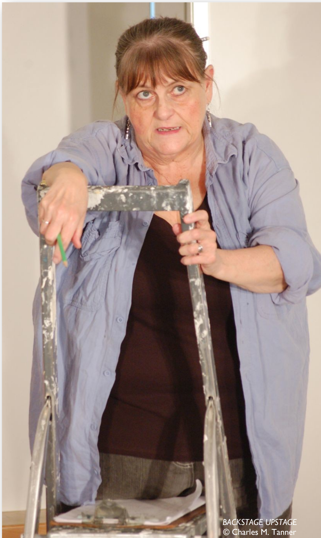
BACKSTAGE UPSTAGE © Charles M. Tanner