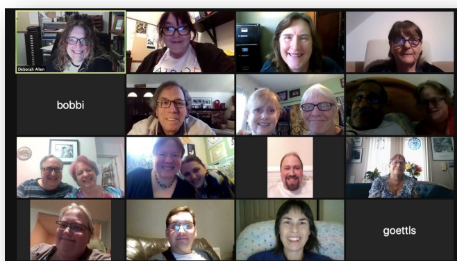
Classes, devotions and celebrations on Zoom!

We slowly started to find opportunities to perform, although, many churches continued to hold services via Zoom and maintained strict distancing procedures. Schools, too, were reluctant to allow visiting groups into their premises due to the high incidence of COVID transmissions.