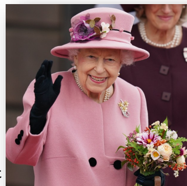
HM Queen Elizabeth II

As spring moved into summer, better weather and the chance to get outside seemed to give people a confidence to start to move out into the community and to begin to socialise, once again. This was greatly helped by HM Queen Elizabeth II's Platinum Jubilee in June. We were blessed to be part of the celebrations, performing at a community street party in Chesterfield, Derbyshire.