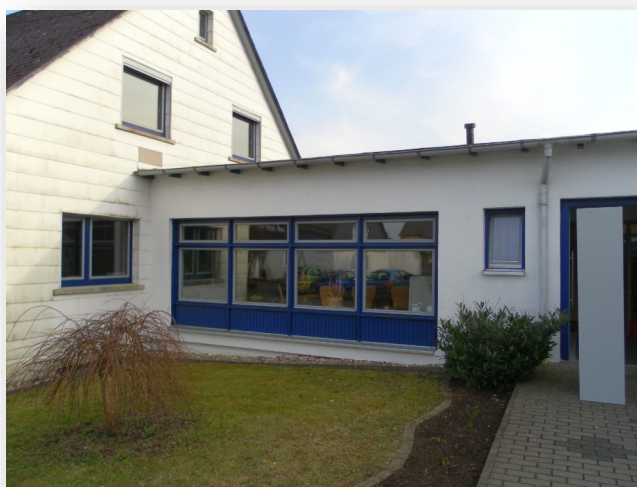
The CP house in Stahlhofen am Wiesensee, Germany.

In July, I was finally able to travel to Germany, joining together with the Covenant Players based there for the first time since February 2020. It was a blessed time of fellowship and community and hard work. We worked together beginning the process of preparing to put the house at Stahlhofen am Wiesensee, Germany , up for sale. This has been a huge undertaking which continued throughout the year. I made a further trip across to continue the work in October/November.