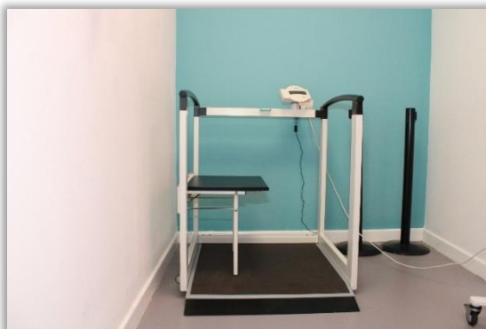
Digital wheelchair scales