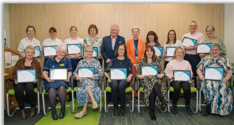
Presentation of long service award certificates to staff who look happy to work here