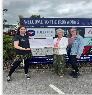
Borderland Rotary and British Ironworks donations