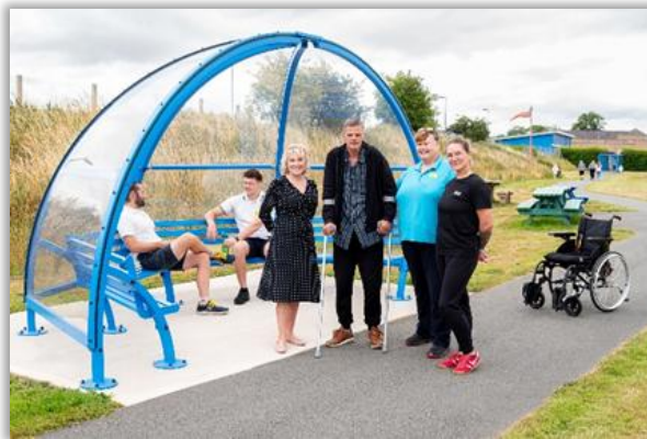
Covered seating on Path of Positivity