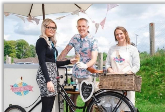
Staff enjoying chatting over a free meal and ice-creams for Togetherness Week