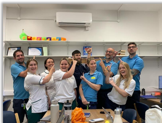
Physiotherapy staff showing their delight in having air conditioning installed in their windowless office