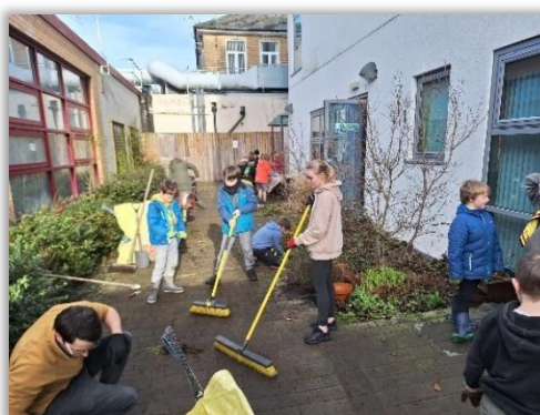
"Willing" volunteers helping improve the garden beds outside Montgomery Ward