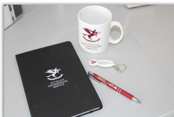
Memorabilia sold to raise funds for the Veterans' Centre

Please see Note 7 to the Accounts on page 42 for the expenditure for these fundraising events.