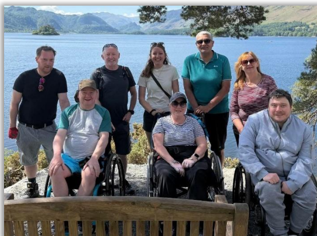
Spinal Injury Unit patients enjoying an outdoor activities week in Keswick