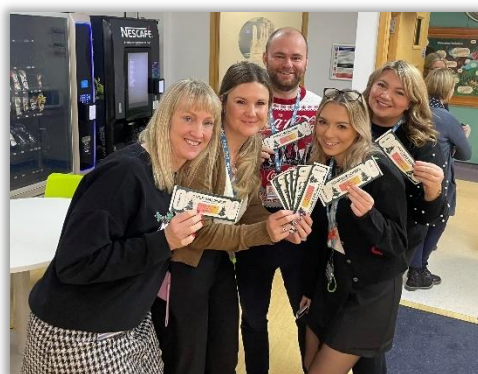
Staff receiving their vouchers for the much looked forward to Christmas Lunch