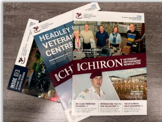
The Charity funds the cost of printing of Chiron newsletter for veterans

update on service funding, community partnerships (e.g., RAF Shawbury selecting the service as a charity of the year), visits from units such as the 69 Gurkha Field Squadron, and volunteer spotlights that show the Hub's culture through veterans' voices. It also highlights wider community support (e.g., equipment donations) and everyday Hub life (such as the RV Café team who welcome veterans and families).