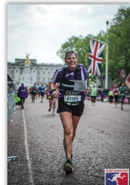
Some of our runners being presented with their certificates and in action