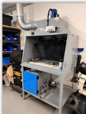
Paint spray booth for ORLAU