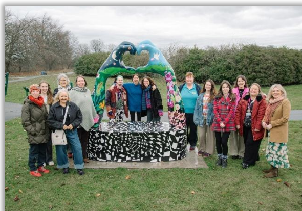
Artwork on Path of Positivity