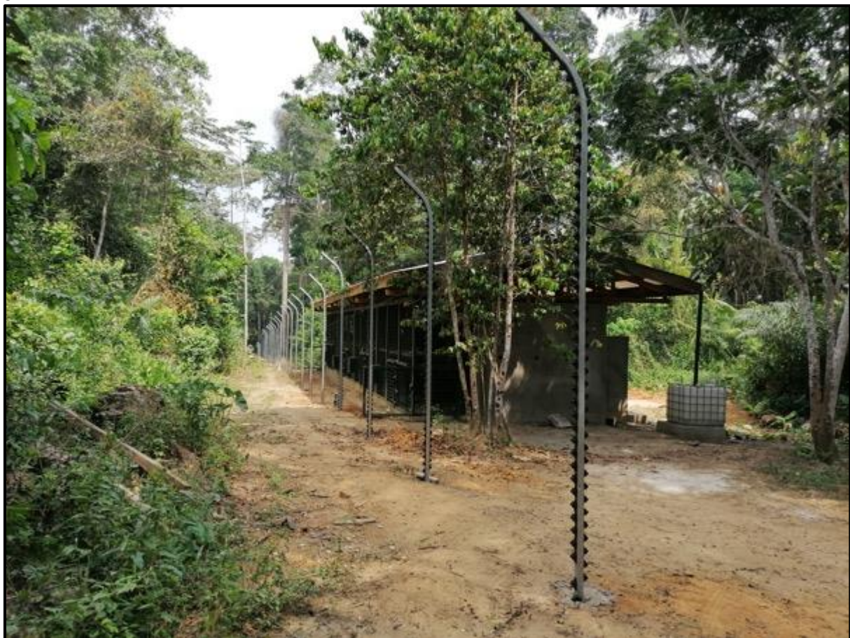
New gorilla enclosure: satellite cages and the fence posts

Construction of the satellite cages of a new forested gorilla enclosure was completed in 2022 after which construction of the enclosure started. Construction of the enclosure progressed well and was finished early in 2023. This enclosure will initially house 7 western lowland gorillas.