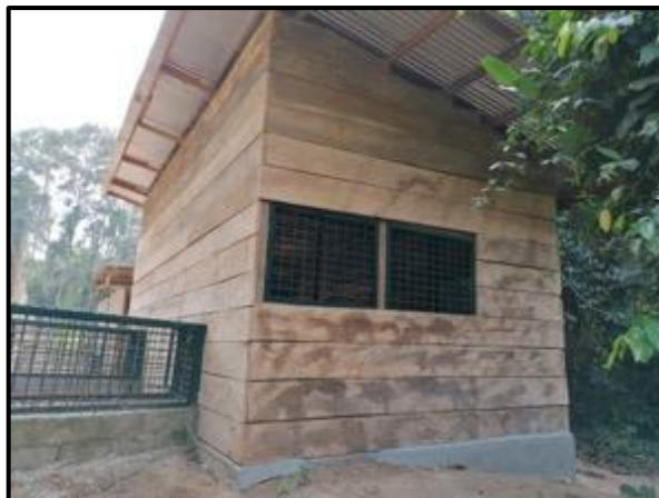
new baboon satellite cage

Replacement of the old wooden posts with new metal posts at one of the nursery enclosures was completed during the year. This has greatly increased the longevity of the enclosure.