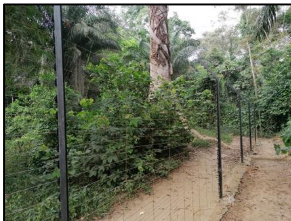
new metal posts at the nursery enclosure.

Replacement of the old wooden posts with new metal posts at one of the nursery enclosures was completed during the year. This has greatly increased the longevity of the enclosure.