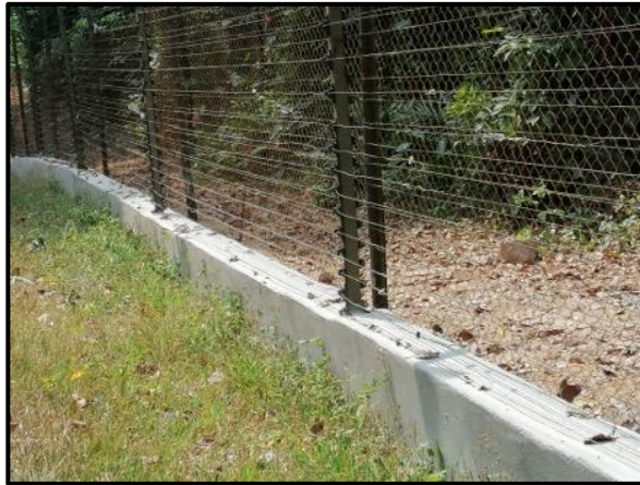
section of the new foundation at the chimpanzee enclosure

Construction of the satellite cages of a new forested gorilla enclosure was completed in 2022 after which construction of the enclosure started. Construction of the enclosure progressed well and was finished early in 2023. This enclosure will initially house 7 western lowland gorillas.