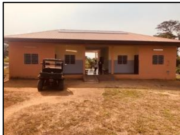
the new health centre by Metet

Two new wooden satellite cages were constructed for the baboon troops. The old satellite cages are still in a usable condition, but the additional cages allow us to house the two troops in the satellites at the same time if required, which was not possible before. It also allows us to divide a single troop into smaller groups when they have to enter the satellite cages, which greatly reduces the risk of conflict and possible injury in the satellite cages.