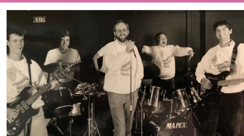
The first Pepper Show in 1989