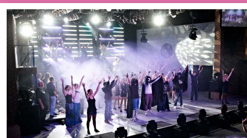
Pepper Show 2010 @ the Centenary Theatre, Berkhamsted