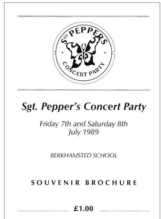
The first Pepper Show in 1989

Remarkably, an annual rock music concert involving children, amateur musicians, schools, volunteers and stage technicians has taken place every year since 1989 except in 2020 due to the pandemic.