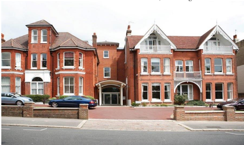
St Mary's House, Brighton

Our work of providing accommodation and care for the elderly has grown steadily from 1954, when the Charity was founded at St Mary's House in Brighton. Today the home is registered for 12 residents and also accommodates a community of 11 sisters which includes two members of the Generalate, the Manager and the Care team.