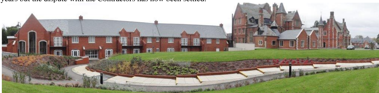
Holy Cross Priory, Convent and Chapel at Heathfield

In transforming what we offer at Holy Cross Priory, we are enabling our work for older people to continue there and flourish. There have been considerable legal costs involved in trying to address serious snagging issues over the years but the dispute with the Contractors has now been settled.