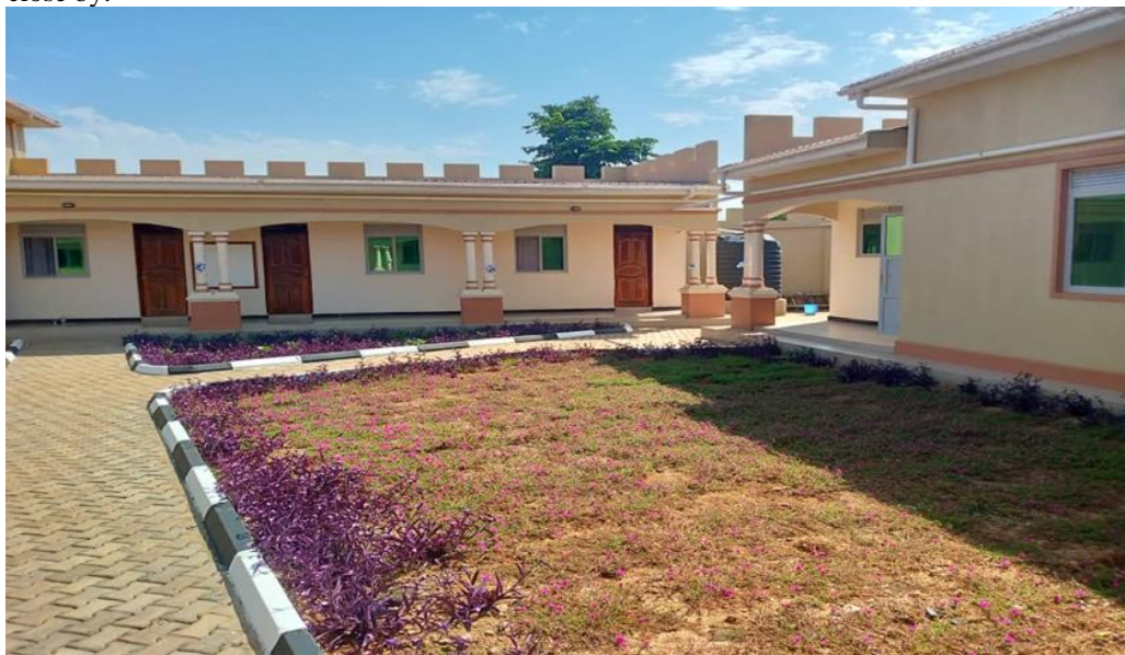
New Convent at Irundu

We run a nursery and primary school and do parish work. During the Coronavirus pandemic the school was redecorated and a small library was built. A small convent was built in 2021 so that sisters working in the school could live close by.