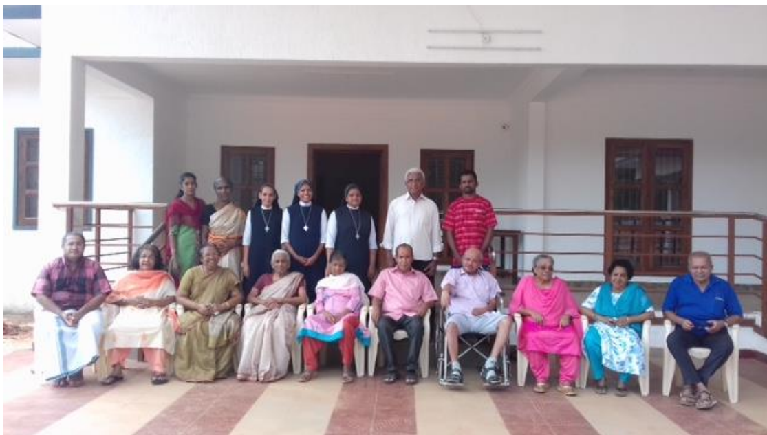
St Joseph's Home, Piravom

FOR THE YEAR ENDED 30 SEPTEMBER 2023 (continued)