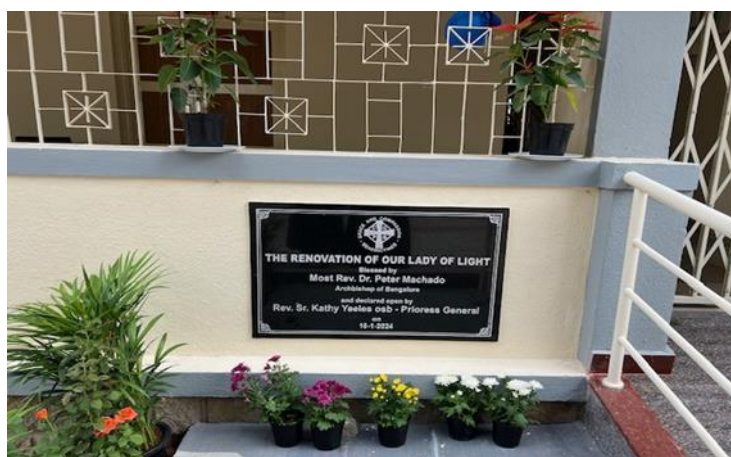
New plaque at Our Lady of Light Bangalore