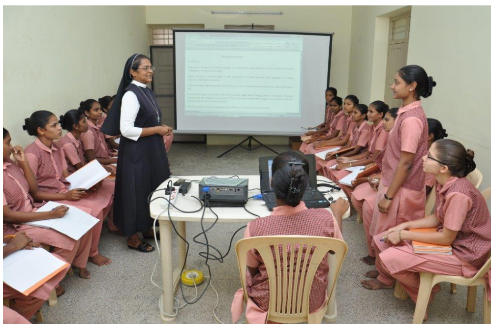
The School of Nursing, Adaiyur