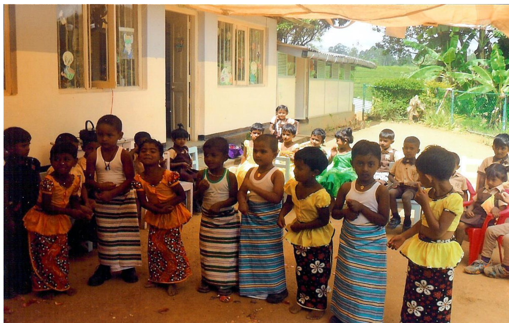
Children at Mattakelle

At Mattakelle a small group of Sisters are working in a rural parish. The Montessori School was refurbished in 2020.