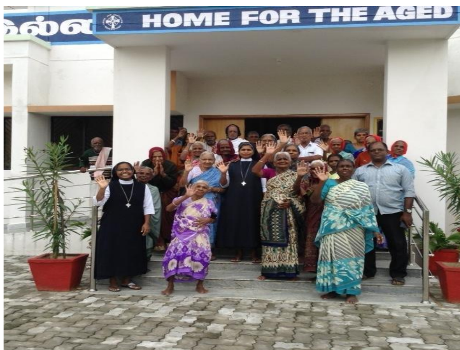
Home for the Aged at Tiruvannamalai

Since 1976 the sisters have been working in Tiruvannamalai and charitable activities are being carried at 9 locations in the states of Tamil Nadu, Karnataka and Kerala.