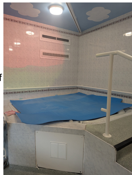
The existing hydrotherapy pool

Hydrotherapy or water therapy involves the use of water for pain relief and treatment. It is different from swimming as it involves performing special exercises in a warm-water pool, and different from water aerobics as it focuses on controlled movements and muscle relaxation.