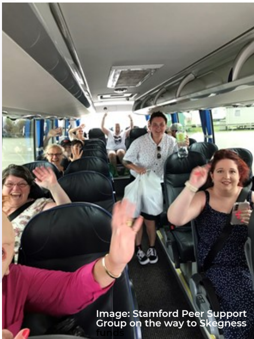
Image: Stamford Peer Support Group on the way to Skegness