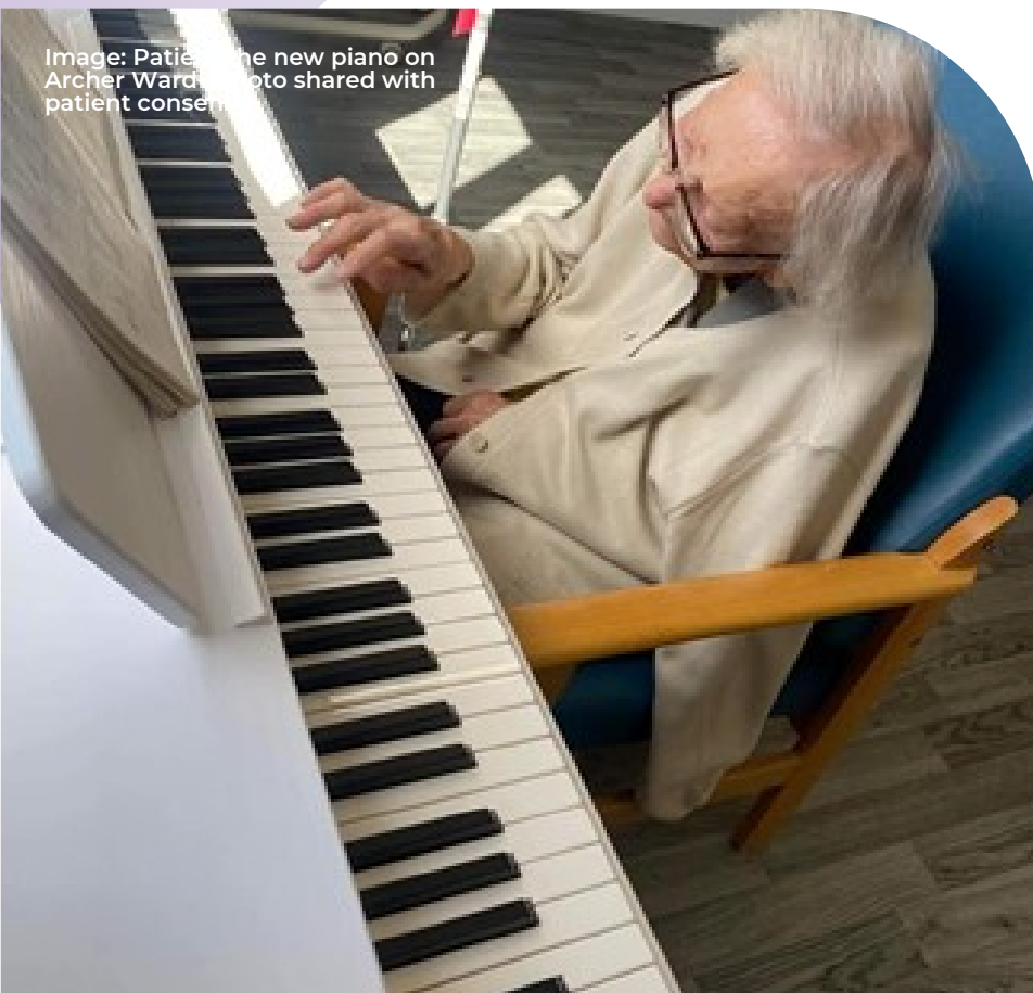
Image: Patient playing the new piano on Archer Ward. Photo shared with patient consent.

The new department piano funded with charitable donations has been a huge hit with staff & patients at Louth Hospital Archer Ward. The idea for the digital piano came from one of the staff nurses who had sourced it online and used charitable funds to purchase it. The team have also said that the piano has provided excellent musical therapy for the patients being cared for on the ward, as well as added fun & laughter for all the patients as they love to reminisce over old songs!