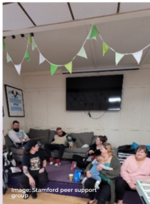
Image: Stamford peer support group