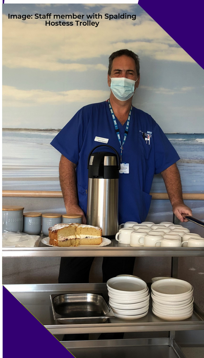
Image: Staff member with Spalding Hostess Trolley

Donations make a significant difference to the lives of patients and staff in Lincolnshire. Donors can tell us how they would like their gift to be spent. This could be a particular service, ward or team, however, the most useful donations are ones where staff can choose how to put the funds to best use for patients.