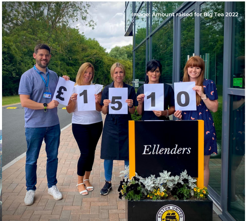
Image: Amount raised for Big Tea 2022