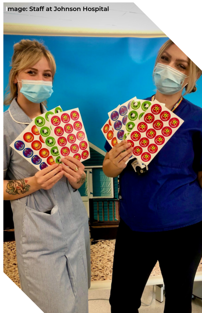
Image: Staff at Johnson Hospital