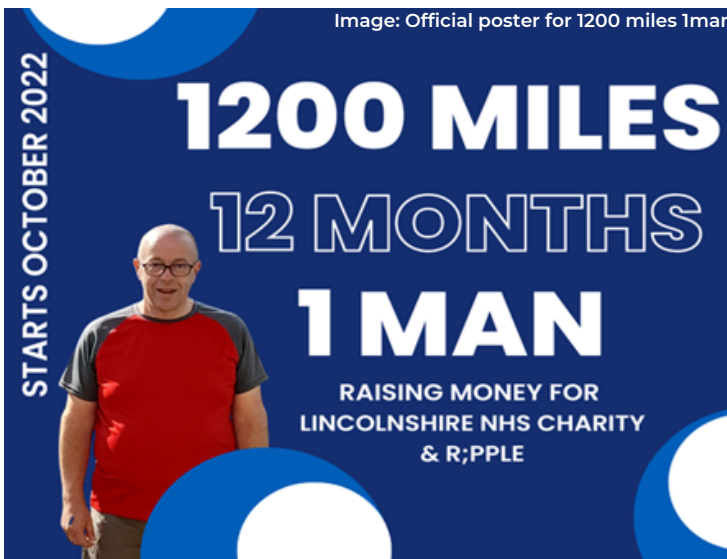
Image: Official poster for 1200 miles 1man