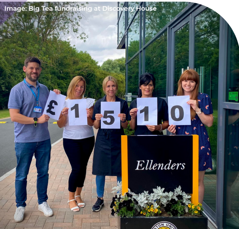
Image: Big Tea fundraising at Discovery House