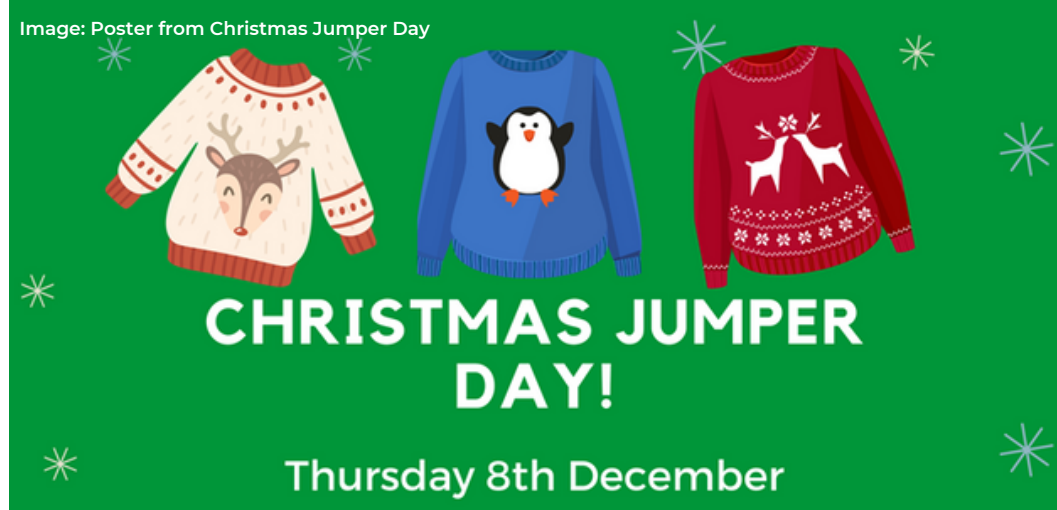
Image: Poster from Christmas Jumper Day