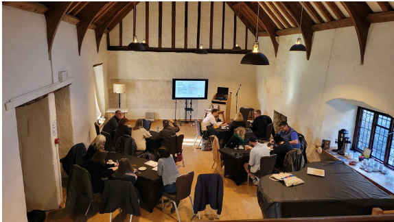
Training at Dartington