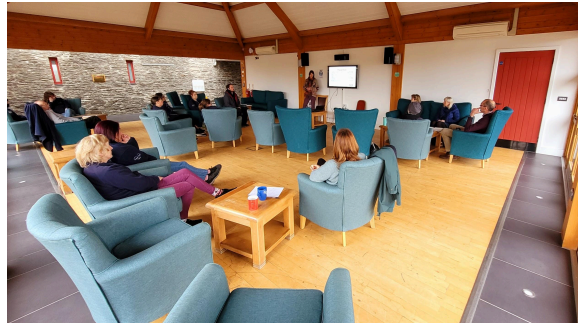
Training at the Calvert Trust