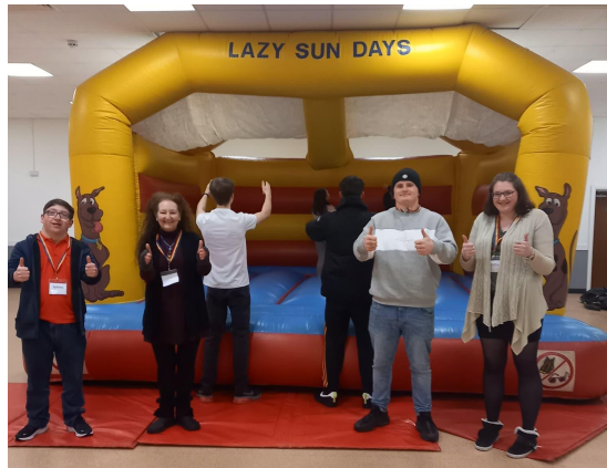
Photo courtesy of Dunkeswell Youth Club - Enjoying their bouncy castle evening!