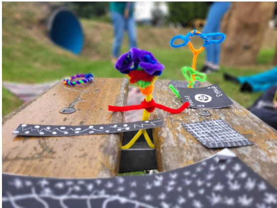
Crafts produced by young people in Axminster