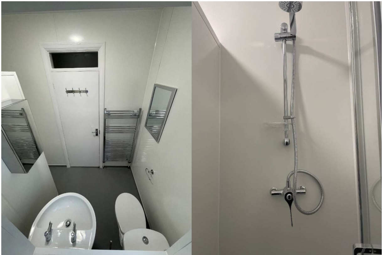
Finished shower room

The bathroom is now finished and appropriate for a high level of usage, and the wipe clean surfaces provided are perfect for shared accommodation.