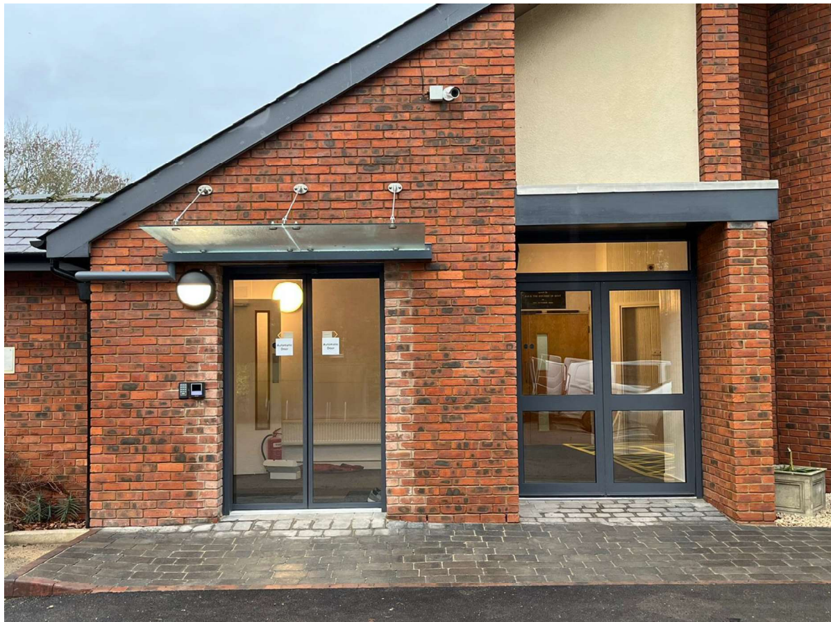
Entrance after refurbishment