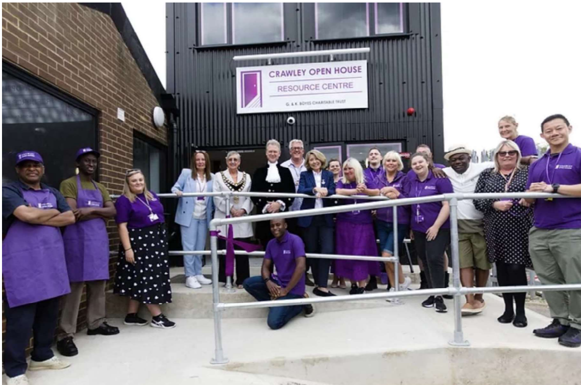
Opening of the new Resource Centre

The value of donated professional services and construction products from CRASH Patrons and Supporters came to £58,780. CRASH also gave a grant of £30,000 make the total value of help delivered a total of £88,780.