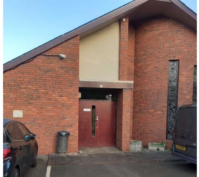
Entrance before refurbishment

The charity now needed to improve the accessibility to their Grade II listed building, for people coming for visits and day treatments. The hospice offers therapy treatments, counselling, art therapy, training and education, and a café and well-being garden. The original main entrance which cannot be changed, was narrow and has a step which meant it did not align with the hospices main aim, to create equitable access to all their services.