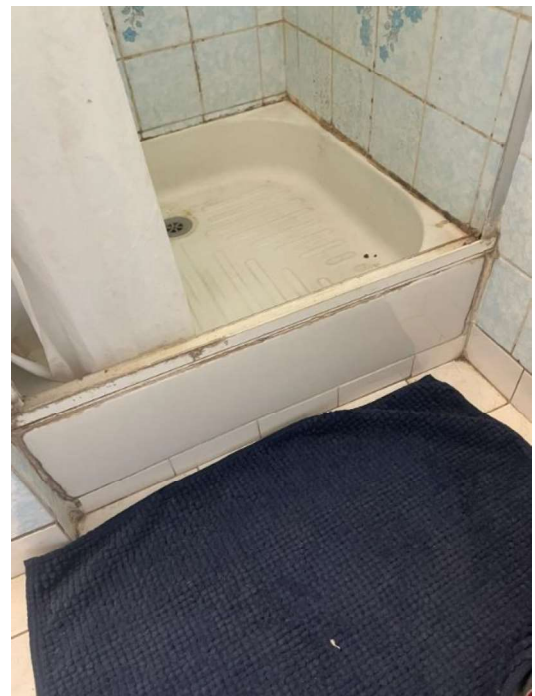
Old bathroom in need of refurbishment

CRASH Corporate Patron VolkerFitzpatrick led the build and worked with the support of their sub-contractors, Lawsons Group, Mossford and Pentalec, to strip out the old bathroom and construct the new one. CRASH engaged our Corporate Patrons Geberit, who generously donated the sanitaryware, Dulux Decorator Centre, who supplied the paint, and supporter Altro who provided the flooring and wall panelling.