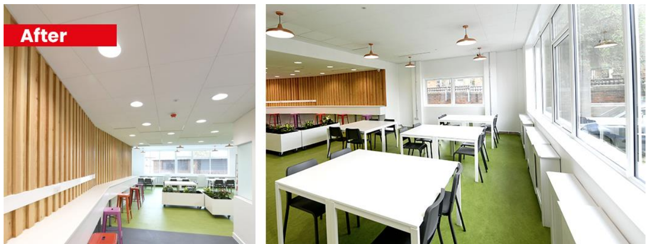
The impressive transformation of the dining room at Caritas Anchor House.