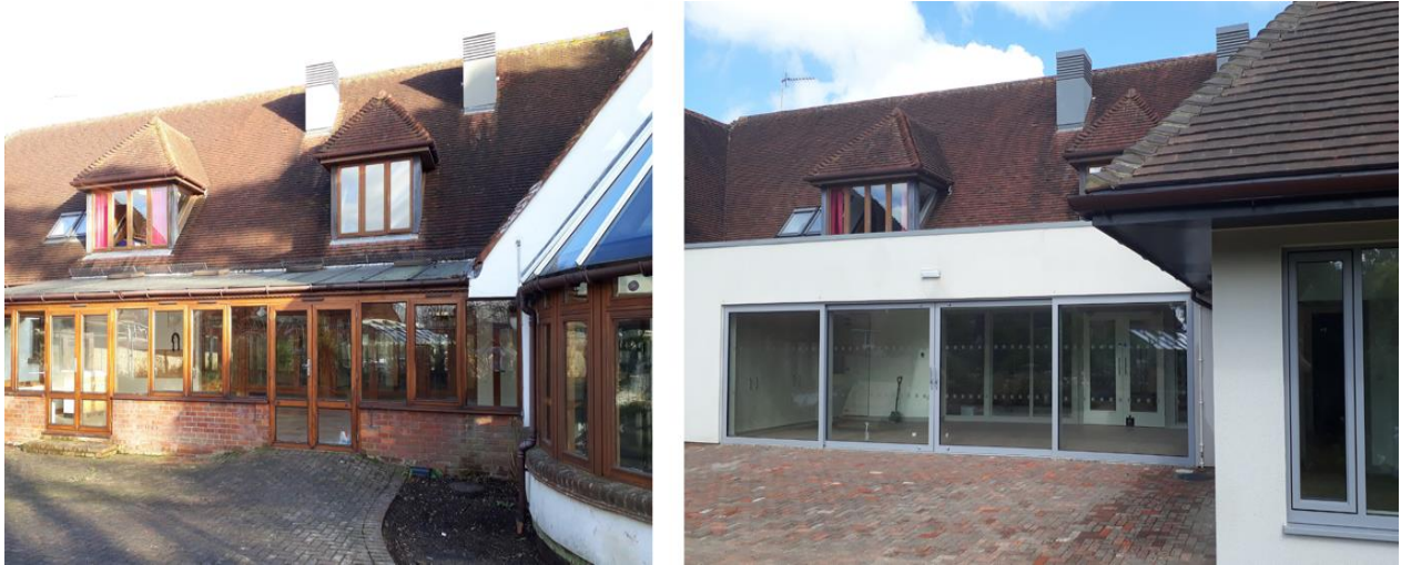
CRASH Corporate Patrons transform Rennie Grove Hospice Care