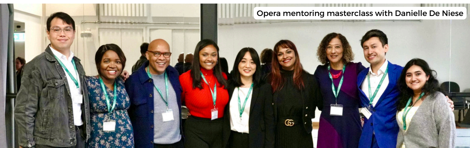
Opera mentoring masterclass with Danielle De Niese

The Trustees intend to apply all funds that they raise to the principal aims and activities of the Company. The Trustees' policy is to invest any surplus funds on bank deposit accounts to maximise the income but with no risk to capital.