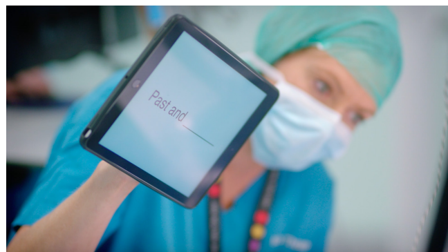
A still from a charity funded video to inform patients on the awake craniotomy procedure.

Day-to-day administration of the funds is dealt with by the Fundraising Team in conjunction with the Financial Accounts section of the Finance Department.