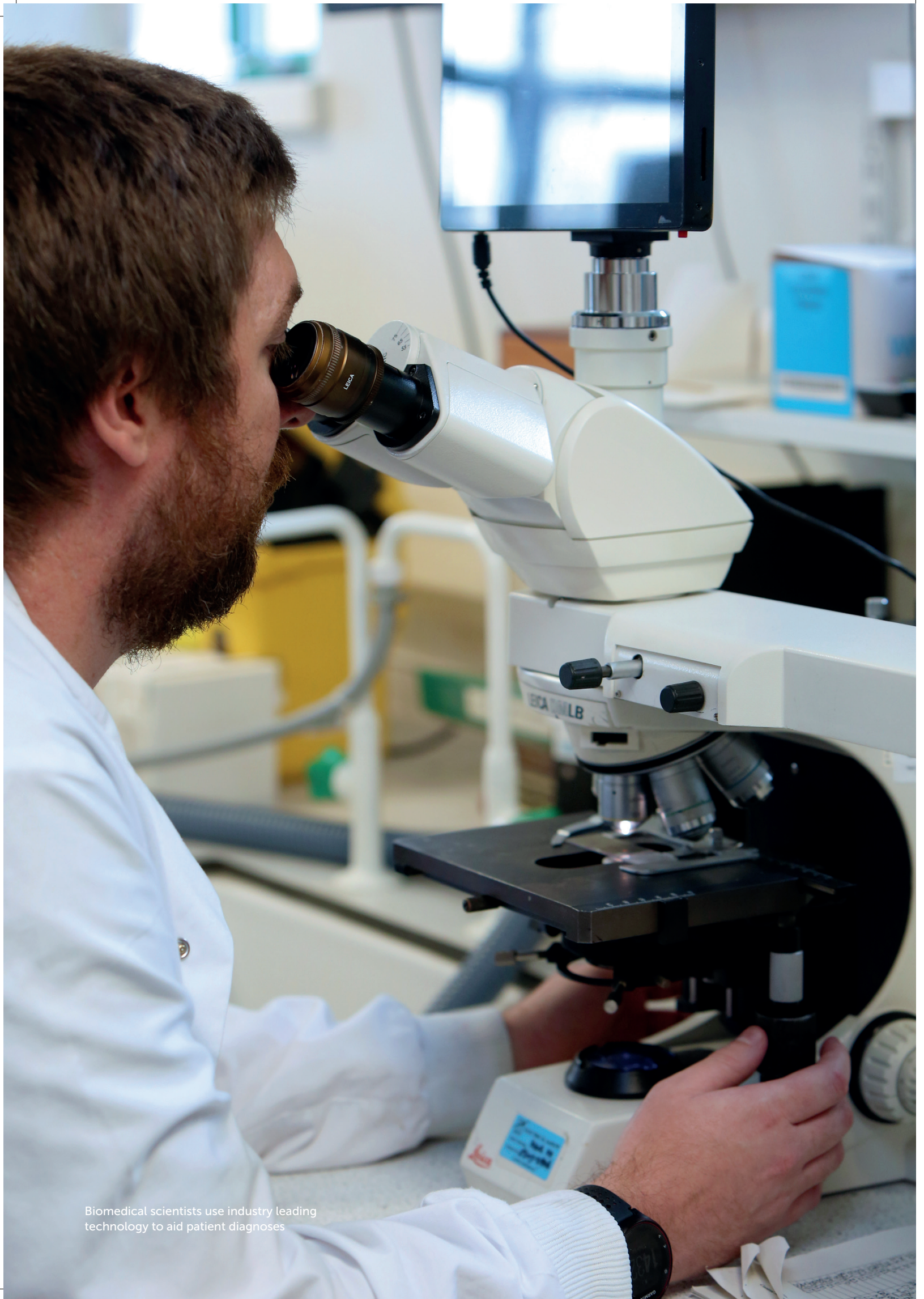
Biomedical scientists use industry leading technology to aid patient diagnoses