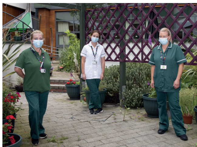
Occupational Therapists in the Complex Rehabilitation Unit garden

Day-to-day administration of the funds is dealt with by the Financial Accounts section of the Finance Department.