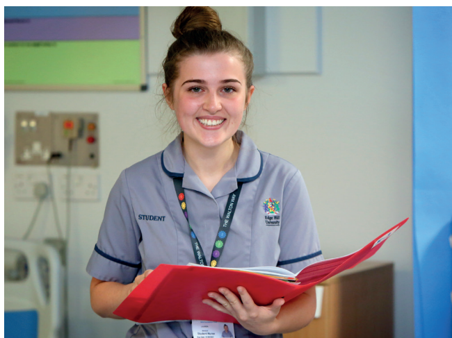
A student nurse, on training at The Walton Centre

During the year under review, all the above mentioned roles were suspended as the Volunteers were not able to come to site due to health and safety and infection control restrictions. Some of the Volunteers were identified as having to shield following government guidelines, so the Charity funded health and wellbeing boxes sent to their homes to ensure they felt valued and appreciated, and the Patient Experience Team kept in touch with them on a regular basis throughout the year.