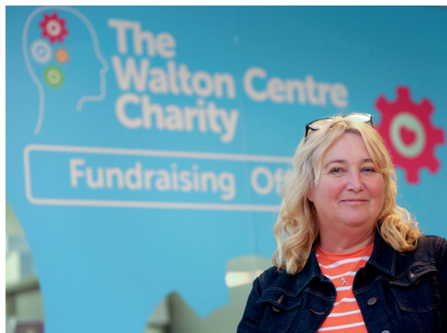
Fundraising at The Walton Centre

As referred to earlier, the effects of the pandemic severely impacted the Charity's ability to fundraise during this year, as government restrictions prevented the delivery of all planned fundraising activities and events. As a result, the total cost of fundraising decreased by £42,000 on the previous year, as there were no costs directly related to managed events. Despite all the challenges of this year there were still amazing efforts made to fundraise despite, but in adherence to, the restrictions in place. Individuals took up their own personal challenges to fundraise – whether that was running, cycling or walking – and there were a number of 'virtual' events using social media and other online platforms. Consequently, the Charity website and other digital platforms played a particularly significant role during this year to help facilitate fundraising in different ways.