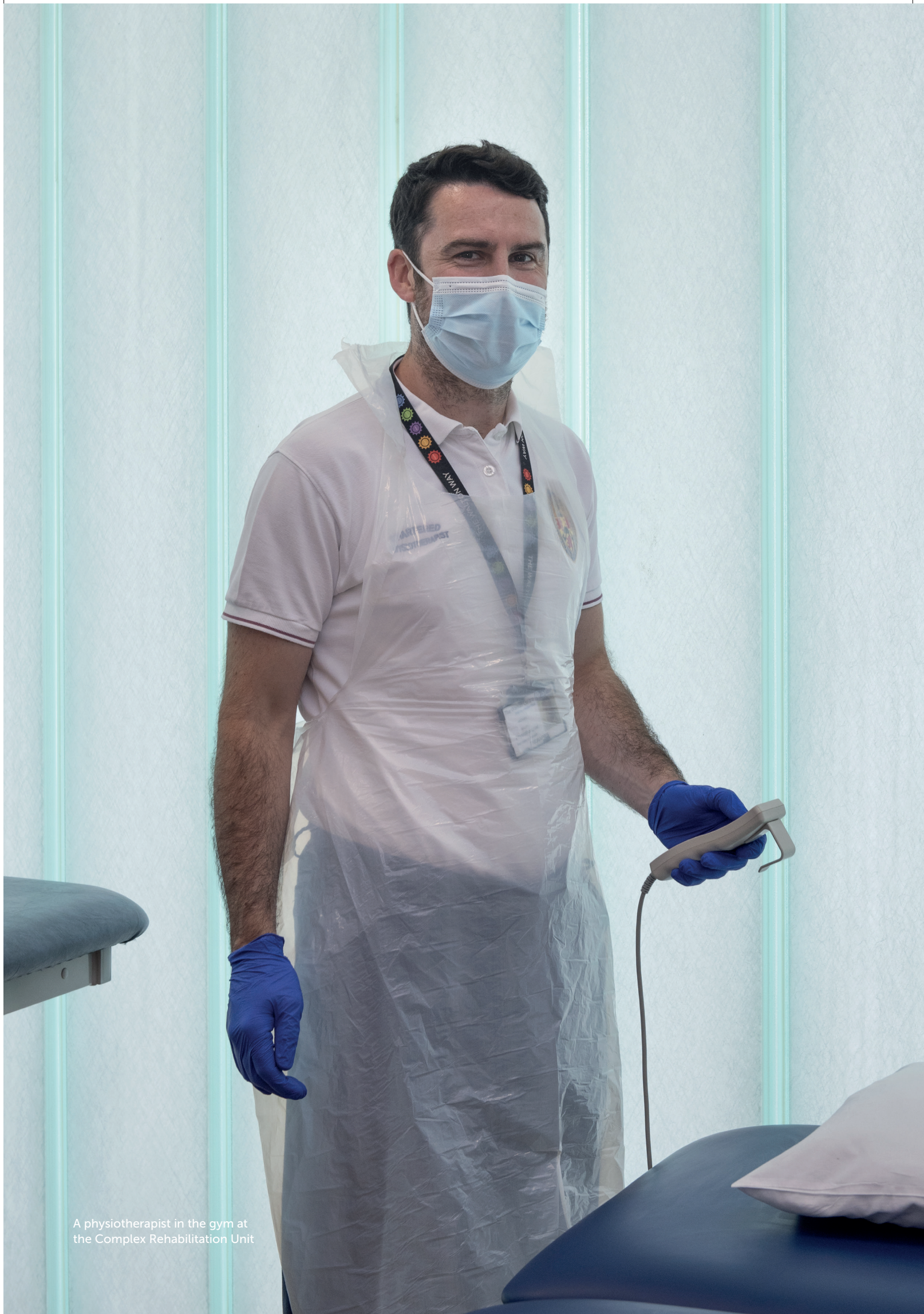
A physiotherapist in the gym at the Complex Rehabilitation Unit