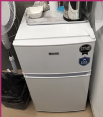
Left: The fridge for the staff in the PALS office