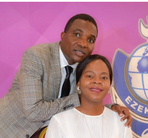
pg. 3 Deputy National Administrator