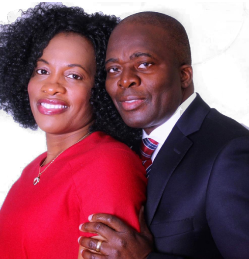
National Administrator 2021