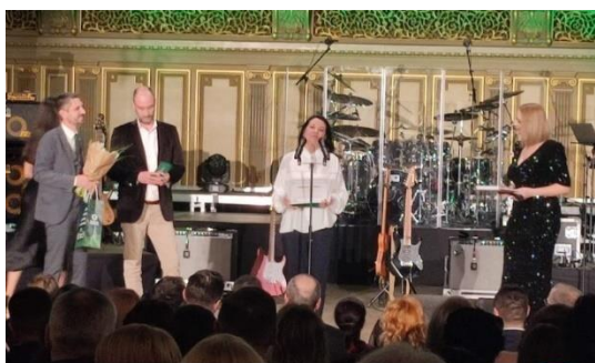
Gala Națională a Excelenței în Asistență Socială