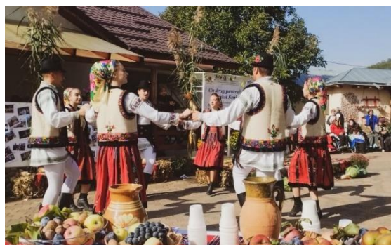
SATUL SENIORILOR MILLY

We express our gratitude and gratitude to the sponsors, supporters, friends of FSC, devoted employees and heartfelt volunteers who are with us in this wonderful project and without whom the story of Milly Senior Village would not have been written so beautifully!