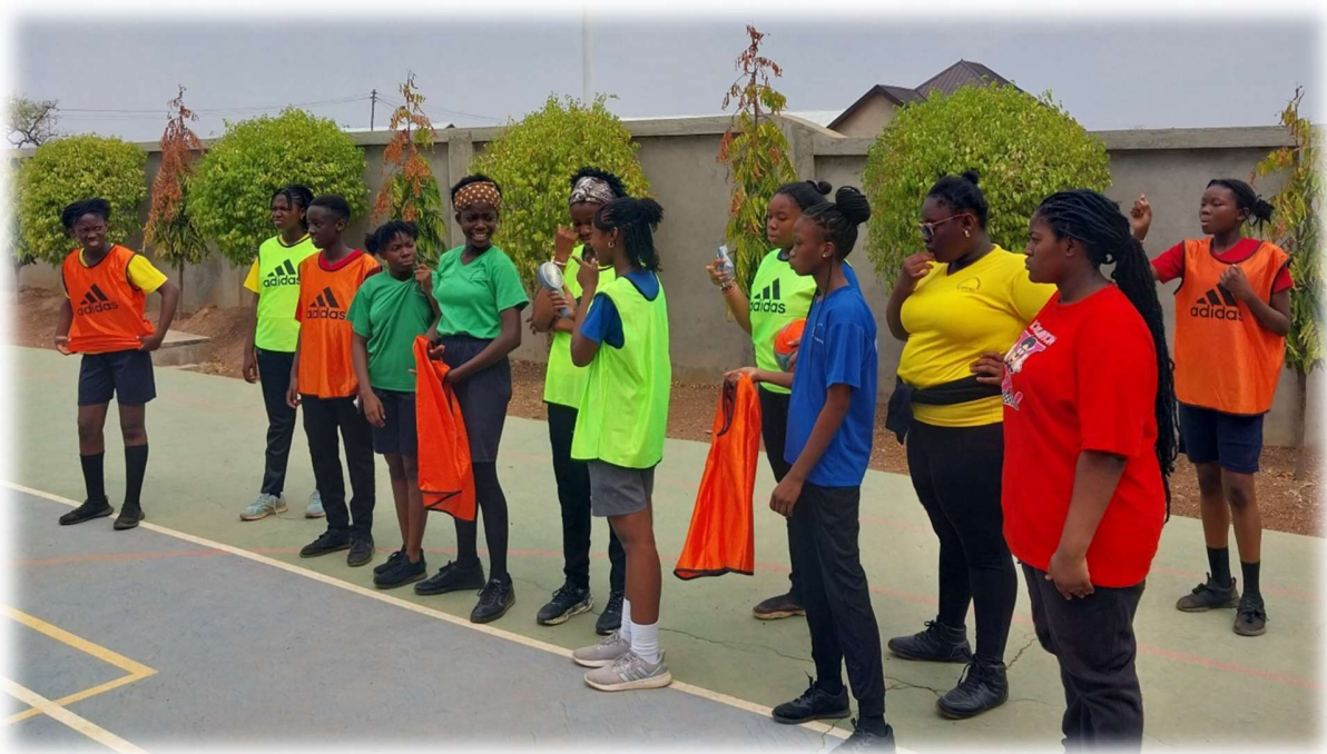
Girls from Savannah International Academy, Ghana, - youth advisors to WKU and our new 'Creating a level playing field' programme'