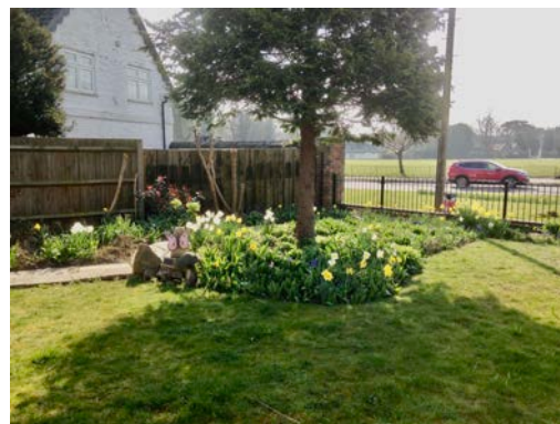
Library picture from a previous year.