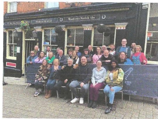
City of Ale Charity of the Year 2023