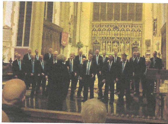
Fine City Chorus at St. Peter Mancroft – Charity of the Year 2023