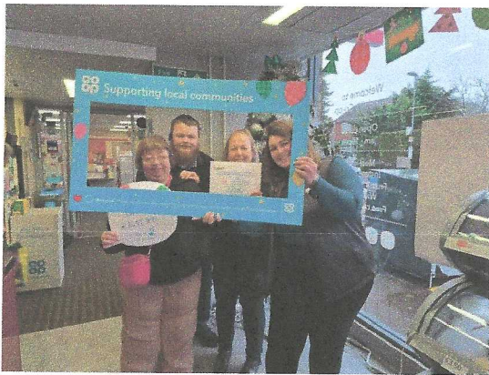
Brundall Coop Charity 2022/23