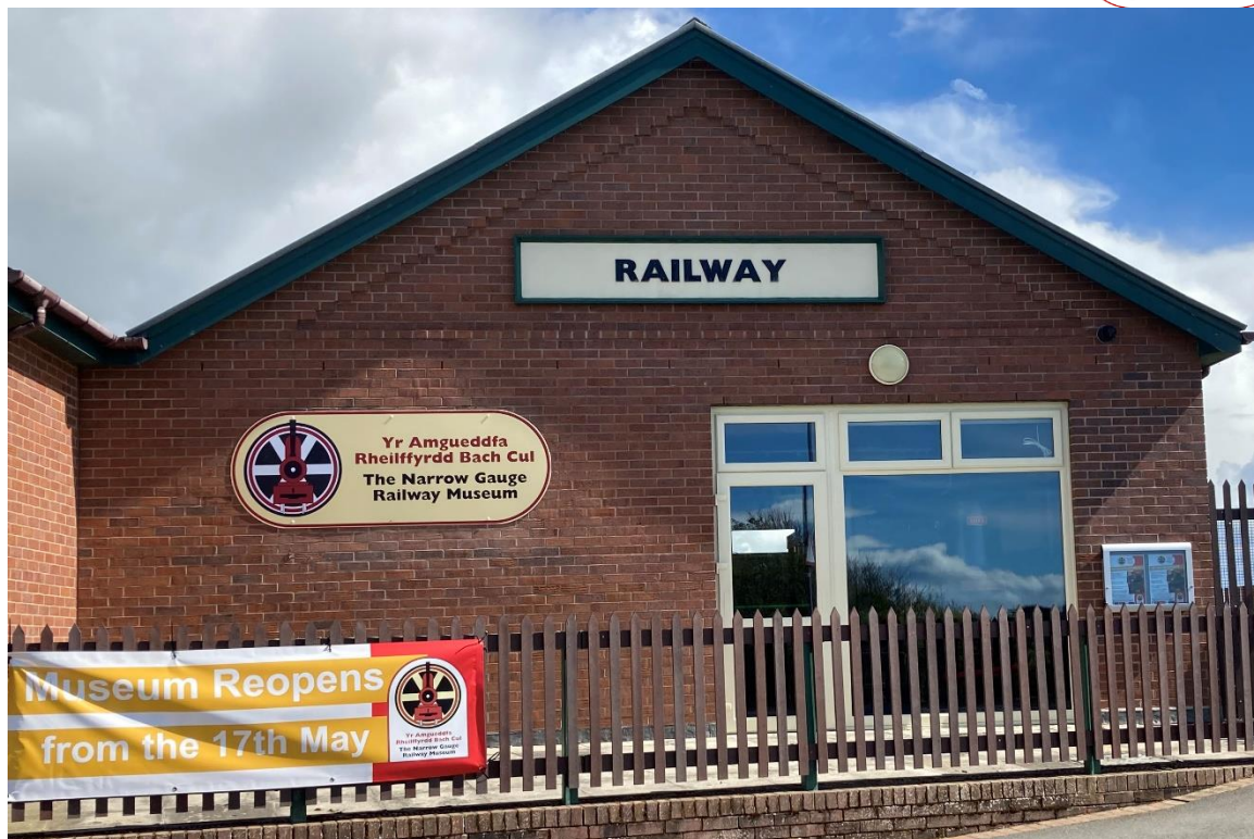
New windows on Neptune Road frontage, providing the required ventilation, and an enticing glimpse into the Museum, with star locomotive exhibit 'Dot' in full view