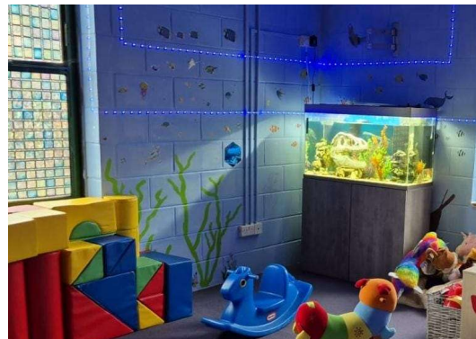
The fish tank in the Sensory Room

Even though the pre-school has more children enrolled with us this year than at the same time last year, finances are very tight, and as you will be able to see from the accounts this is a result of the Government's increase in National Insurance and wage rises. Even though the wages are money well spent (in my opinion), the grant monies for funded children don't increase at the same rate, leaving a funding gap. From January 2026 we will be increasing the fees for additional paid-for hours - not by much - from £5.50 to £6.00 per hour. We have already increased the charge for the healthy snacks we provide from 50p to 60p.