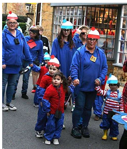
Where's Wally? at the Children's Carnival