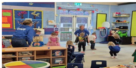
Keep Fit in the Playroom

These increases are clear in the General Fund, which shows the income and expenditure for the core running of the preschool. The balance at the end of July 2025 was £2,437, a very significant decrease from the previous year. However numbers of children are beginning to rise. We need this trend to continue.