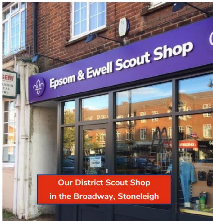
Our District Scout Shop in the Broadway, Stoneleigh

The shop is more than just a place to buy uniforms—it's a hub of Scouting support, teamwork, and community pride.